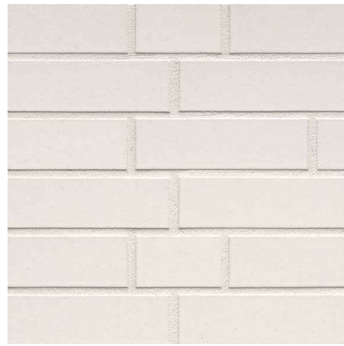
03 - White Bricks ABC Klinker-Engobe Smooth White