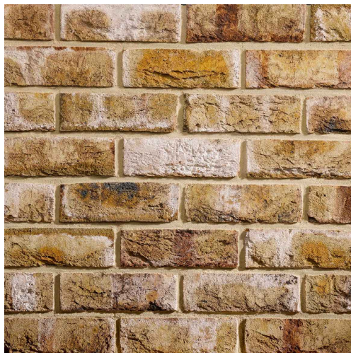
01 - TBS London Weathered Yellow Brick *