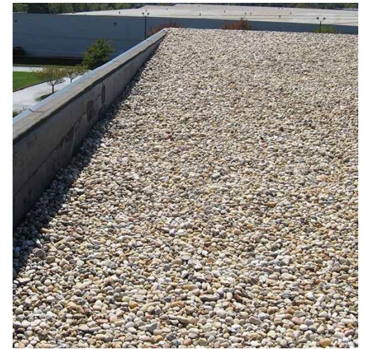
10 - Roof Covering * Washed pebbles