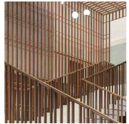
06 - PPC Metal Railings * Colour: Bronze RAL 7008