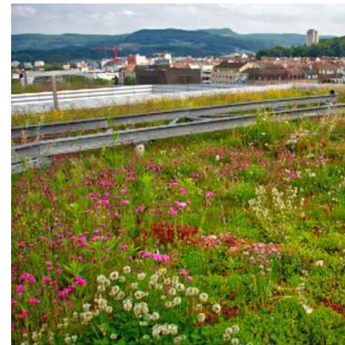
12 - Roof Covering * Biodiverse