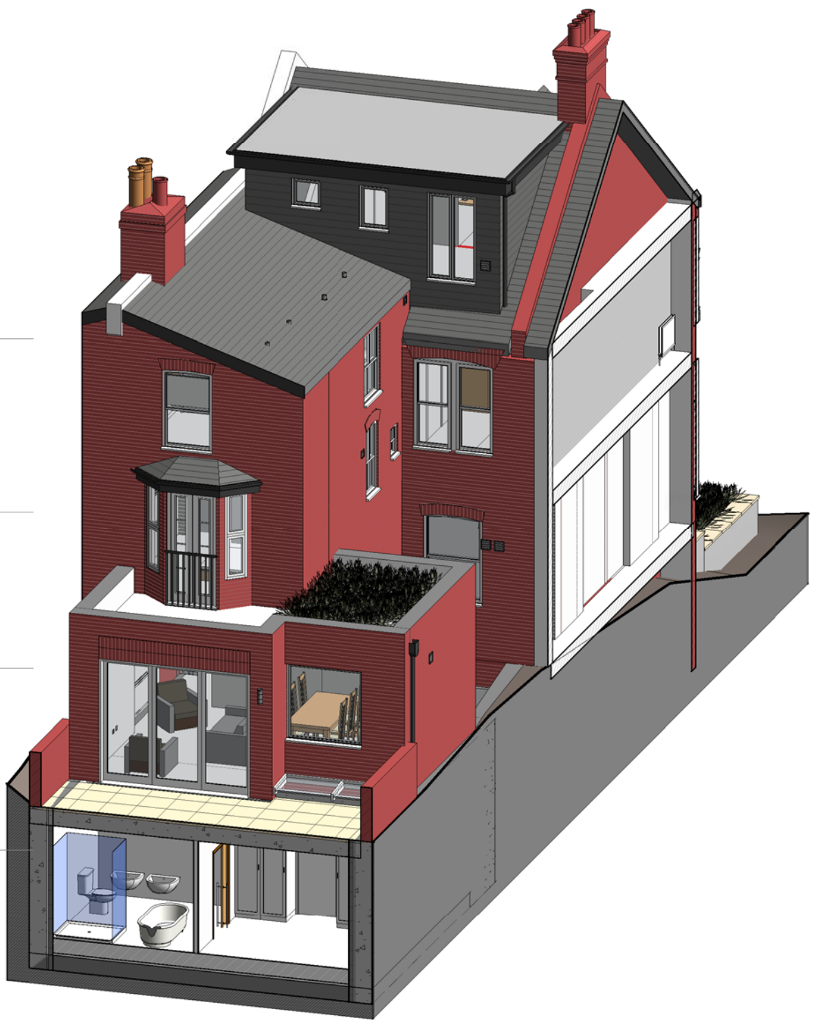
6. 3D - Proposed - Rear