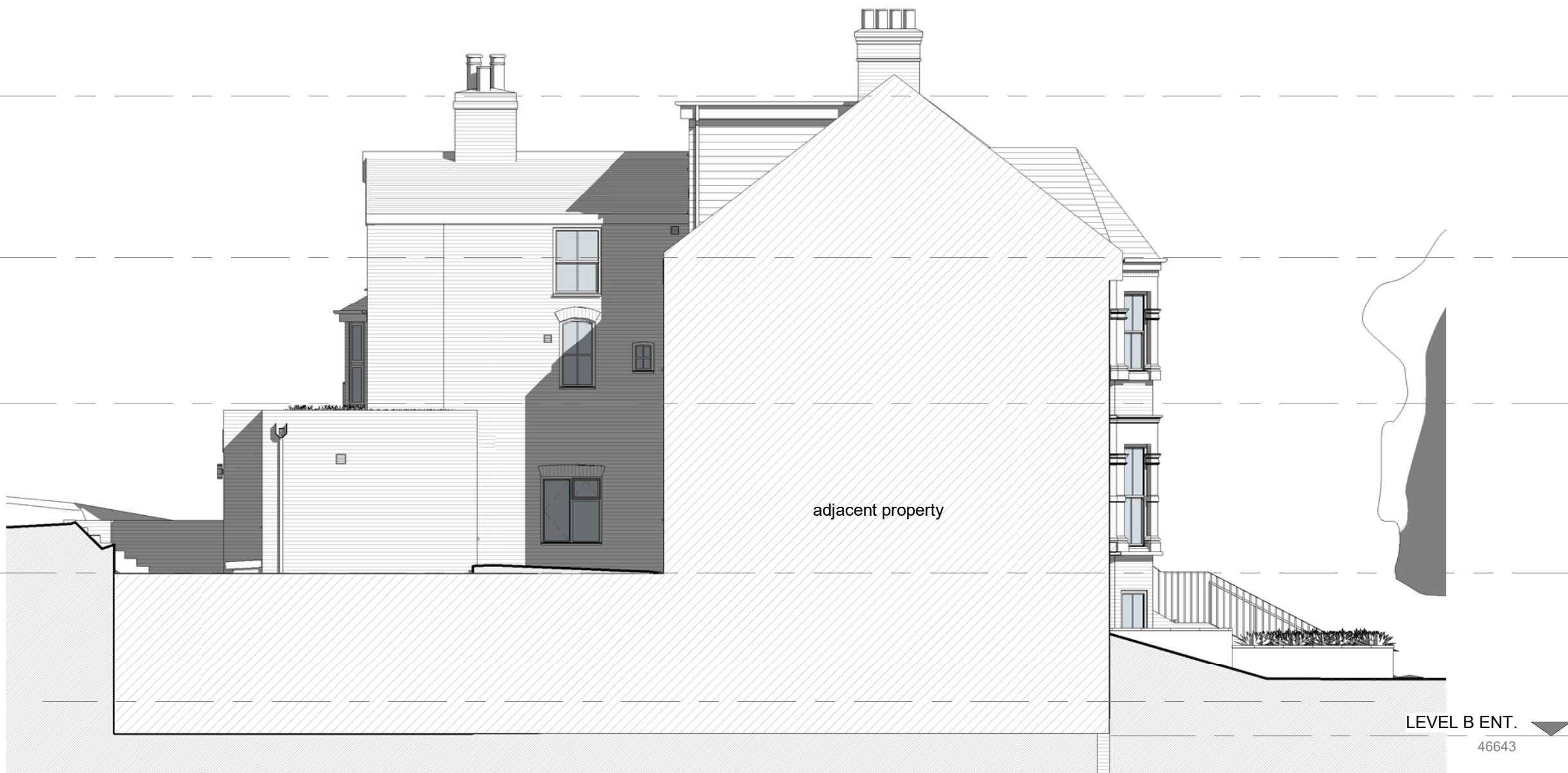
2. Left Side - Proposed 1 : 100