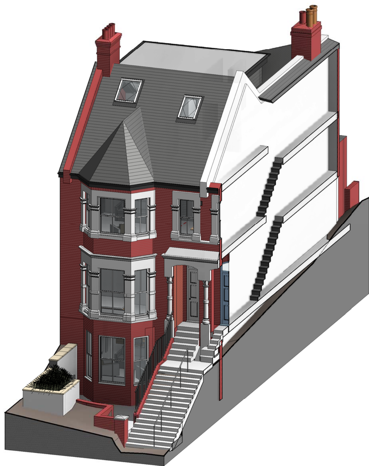
5. 3D - Proposed - Front