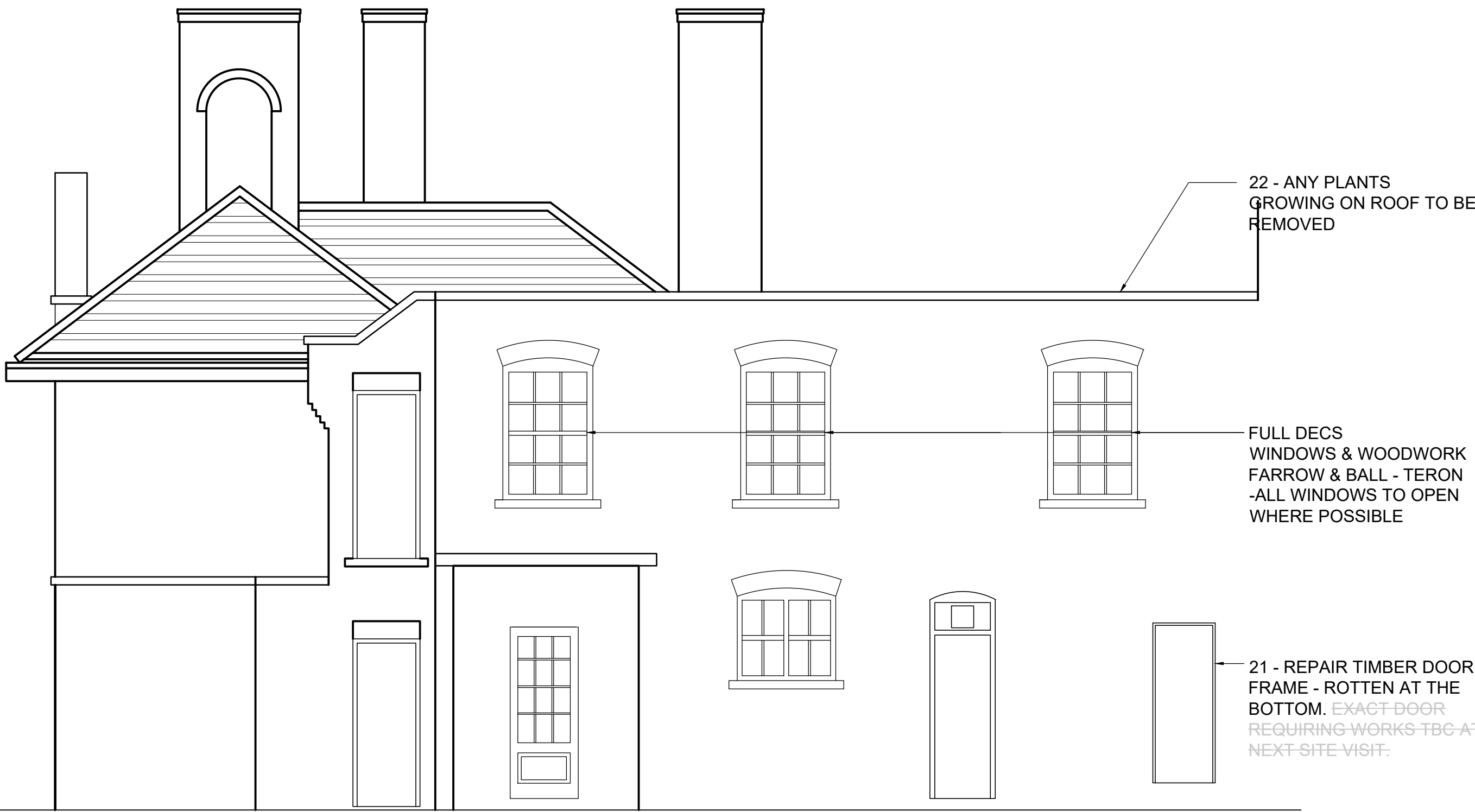
PROPOSED ELEVATION TO NORTH END