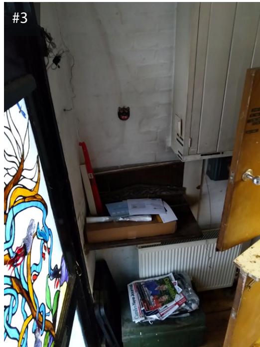
Existing door from the inside