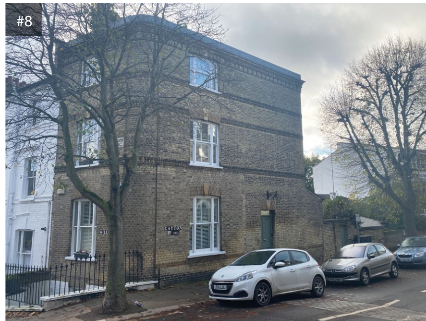
48 Willow Road

We suggest replacing the existing door (#7) by the more sympathetic Victorian door model (#9) which can be seen on the twin building just opposite the road (#8).