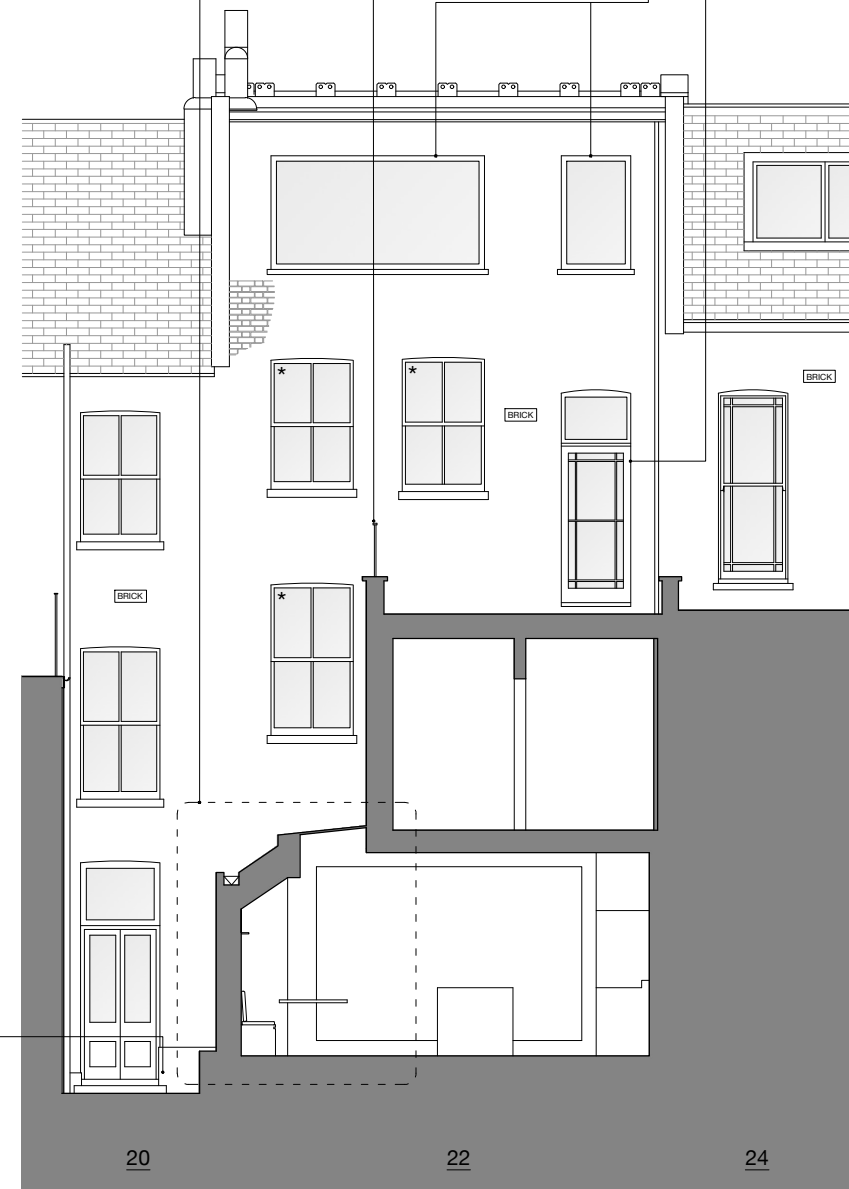
SECTION D-D AS PROPOSED