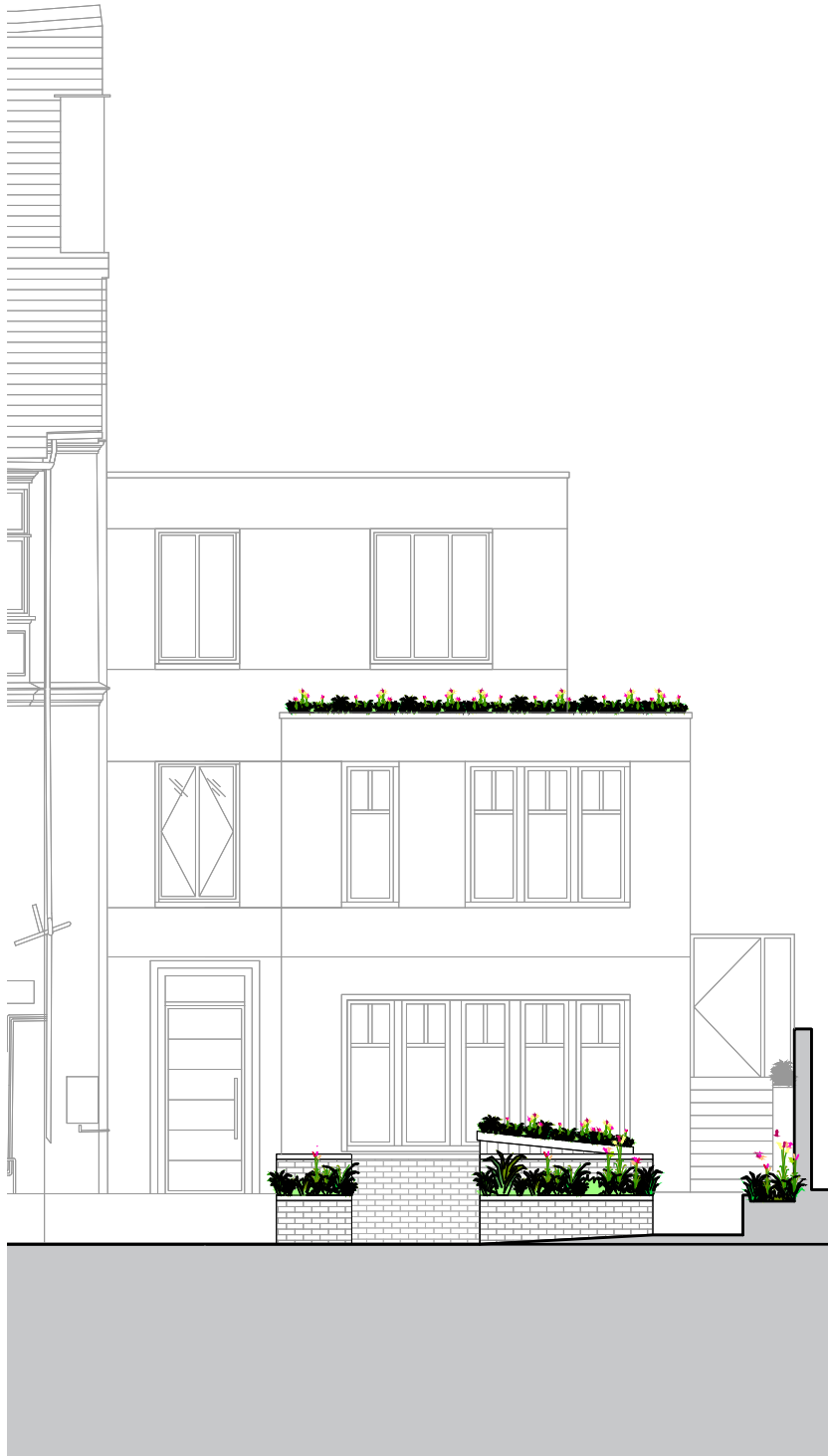
1 PROPOSED FRONT LANDSCAPE SECTION A-A scale 1:100