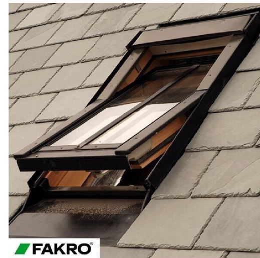
FAKRO Representative image of proposed skylights