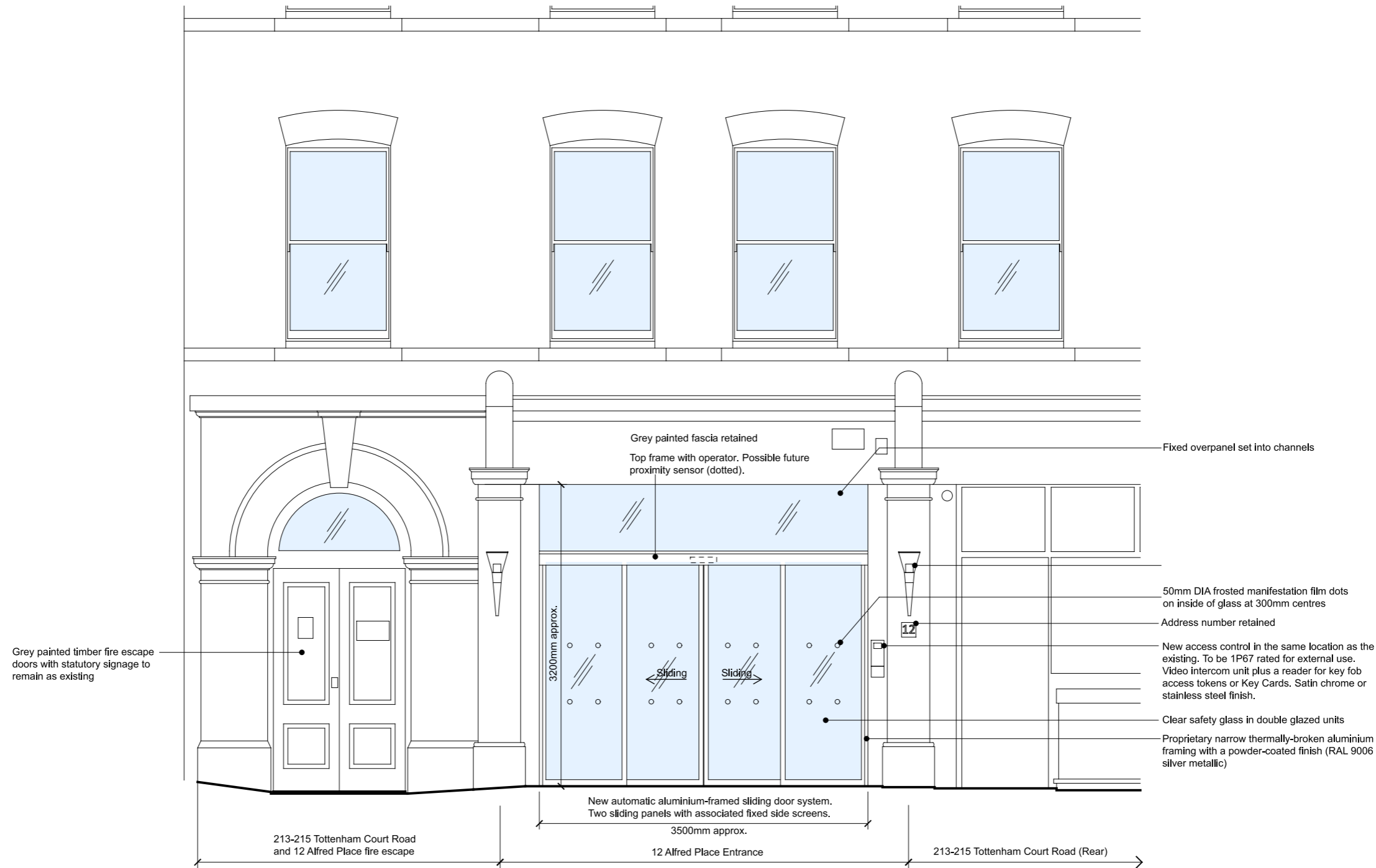
Proposed Alfred Place Entrance Elevation (1:50 @A3)