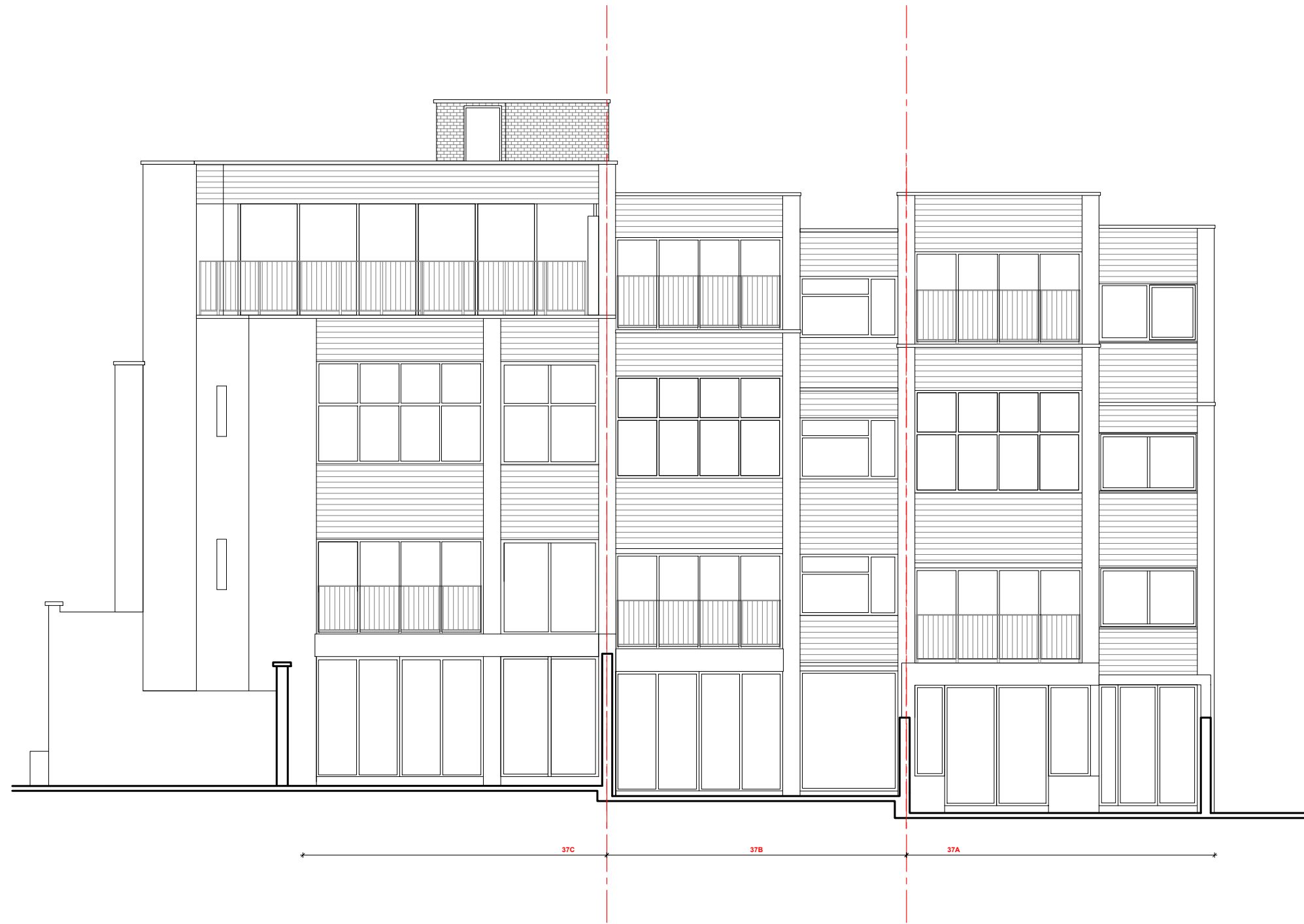
1 BACK ELEVATION - EXISTING_ SCALE 1:100 @ A3