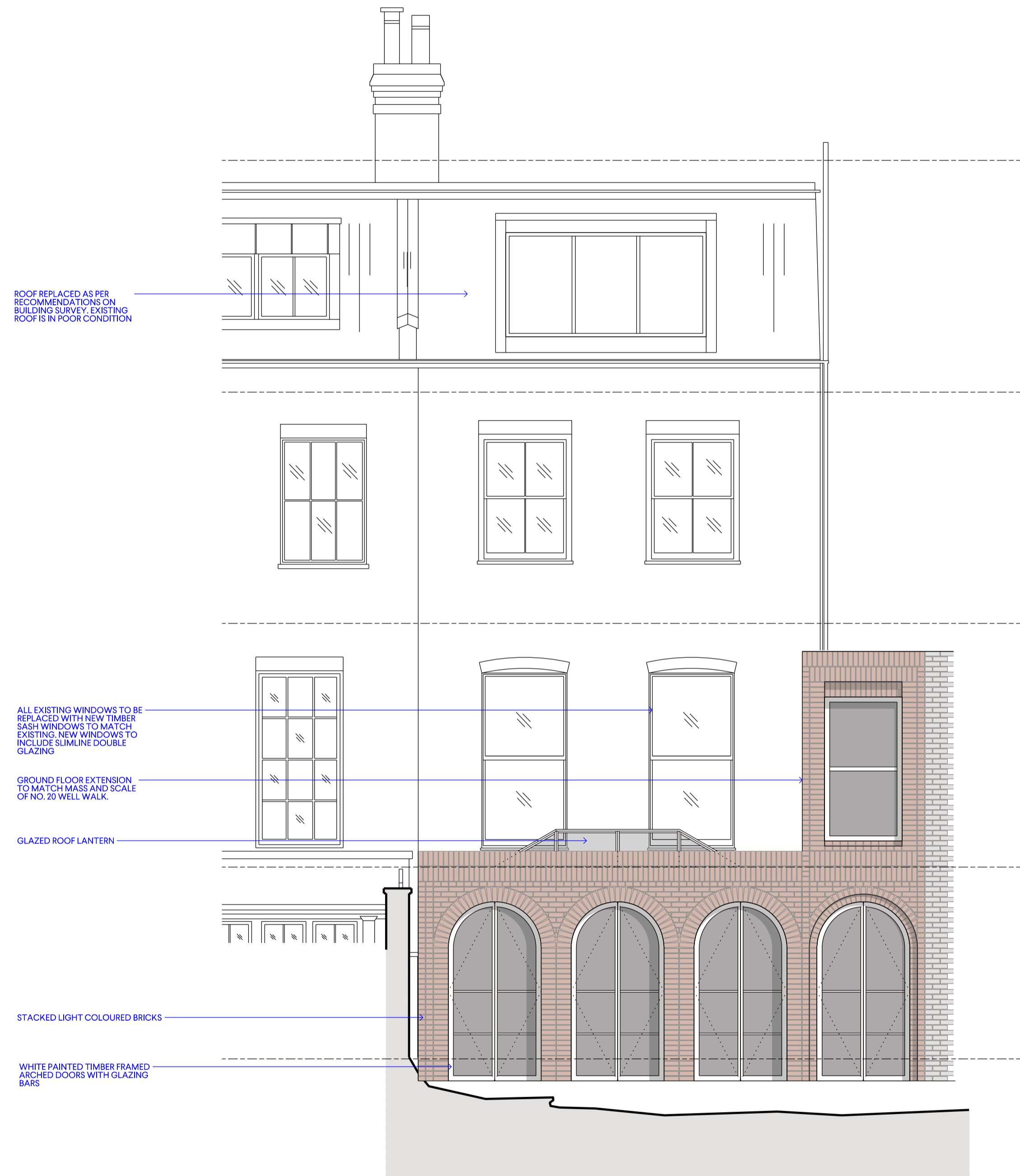
2 1:50 PROPOSED REAR ELEVATION