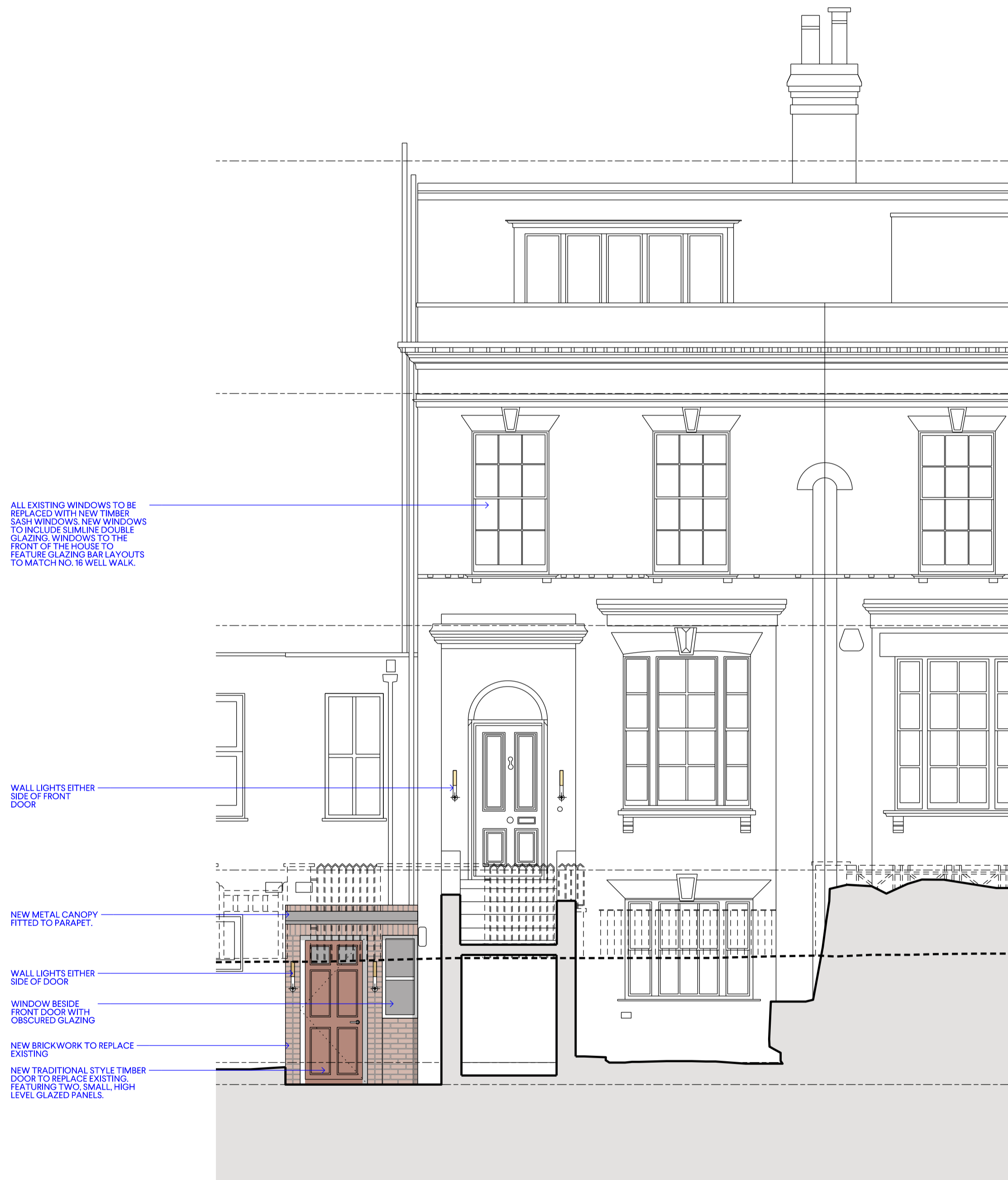
1 1:50 PROPOSED FRONT ELEVATION

DO NOT SCALE OFF THIS DRAWING. DIMENSIONS, AREA AND LEVELS ARE ONLY APPROXIMATE AND SUBJECT TO SITE SURVEY. ALL DIMENSIONS TO BE CHECKED ON SITE. ANY DISCREPANCIES OR VARIATIONS TO BE REPORTED TO THE ARCHITECT BEFORE WORK COMMENCES. THIS DRAWING IS TO BE READ IN CONJUNCTION WITH THE SPECIFICATION, WHERE PROVIDED, AND ALL RELEVANT CONSULTANTS DRAWINGS AND/OR SPECIFIC DRAWINGS DOCUMENTS AND ANY DISCREPANCIES OR VARIATIONS ARE TO BE REPORTED TO THE ARCHITECT BEFORE THE AFFECTED WORK COMMENCES. THIS DRAWING IS PROTECTED BY COPYRIGHT, AND MUST NOT BE COPIED OR REPRODUCED WITHOUT THE WRITTEN CONSENT OF HOD ARCHITECTS LTD. NORTH POINTS SHOWN ARE INDICATIVE. ©