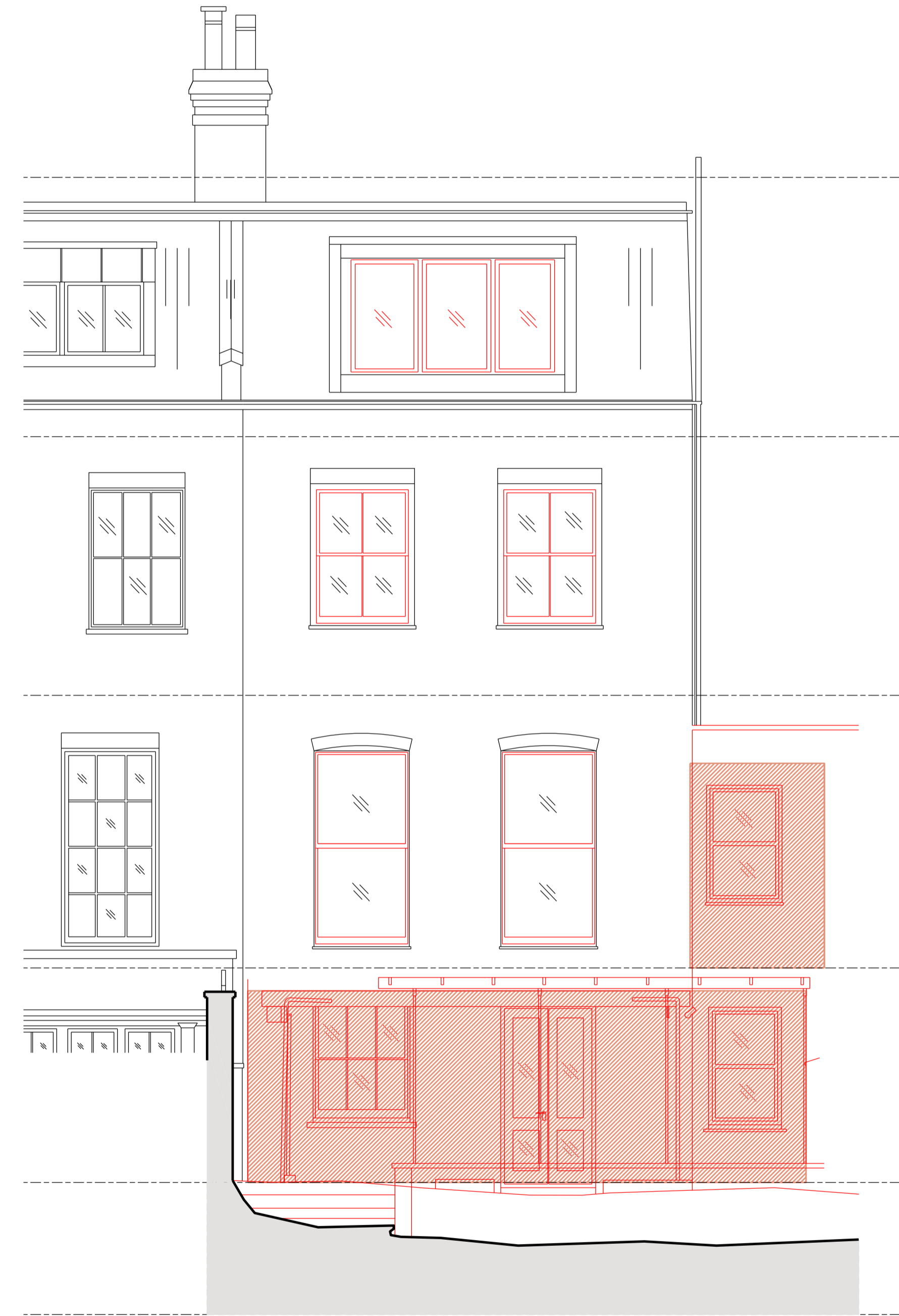
2 1:50 DEMOLITION REAR ELEVATION