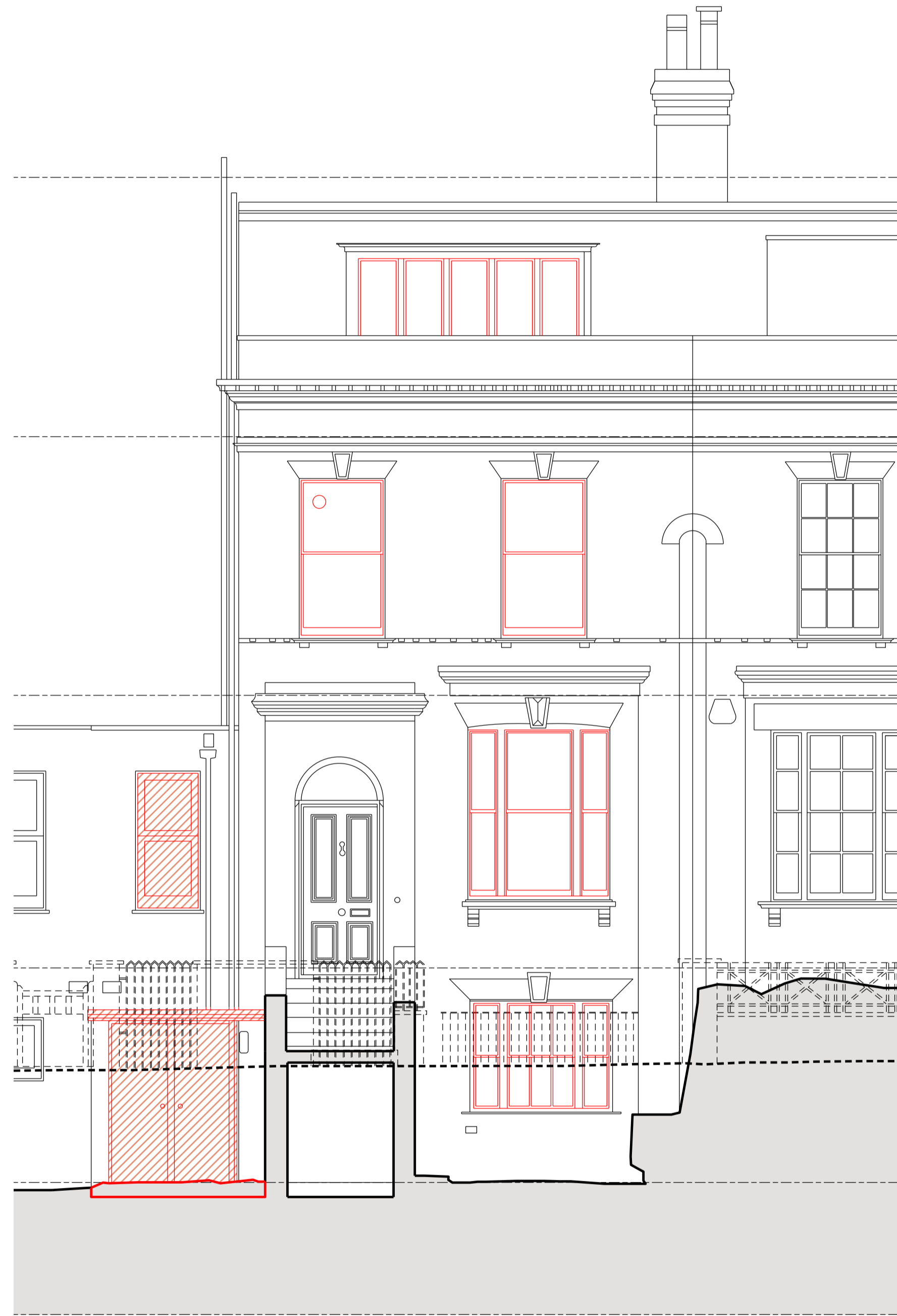
1 1:50 DEMOLITION FRONT ELEVATION

DO NOT SCALE OFF THIS DRAWING. DIMENSIONS, AREA AND LEVELS ARE ONLY APPROXIMATE AND SUBJECT TO SITE SURVEY. ALL DIMENSIONS TO BE CHECKED ON SITE. ANY DISCREPANCIES OR VARIATIONS TO BE REPORTED TO THE ARCHITECT BEFORE WORK COMMENCES. THIS DRAWING IS TO BE READ IN CONJUNCTION WITH THE SPECIFICATION, WHERE PROVIDED, AND ALL RELEVANT CONSULTANTS' DRAWINGS AND / OR SPECIFIC DRAWINGS / DOCUMENTS AND ANY DISCREPANCIES OR VARIATIONS ARE TO BE REPORTED TO THE ARCHITECT BEFORE THE AFFECTED WORK COMMENCES. THIS DRAWING IS PROTECTED BY COPYRIGHT, AND MUST NOT BE COPIED OR REPRODUCED WITHOUT THE WRITTEN CONSENT OF HOD ARCHITECTS LTD. NORTH POINTS SHOWN ARE INDICATIVE. ©