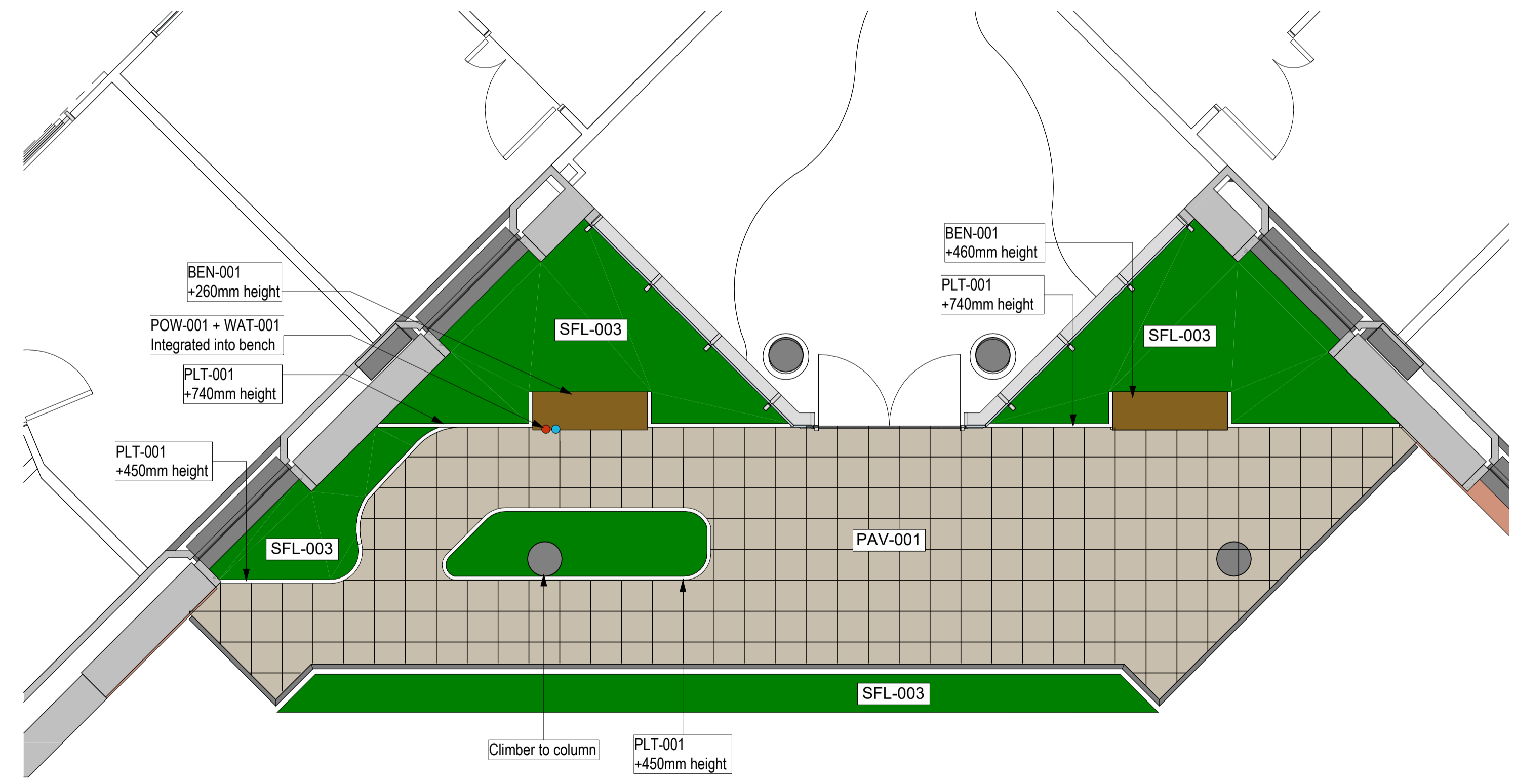
2 Level 6 Children's Balcony 1 : 50