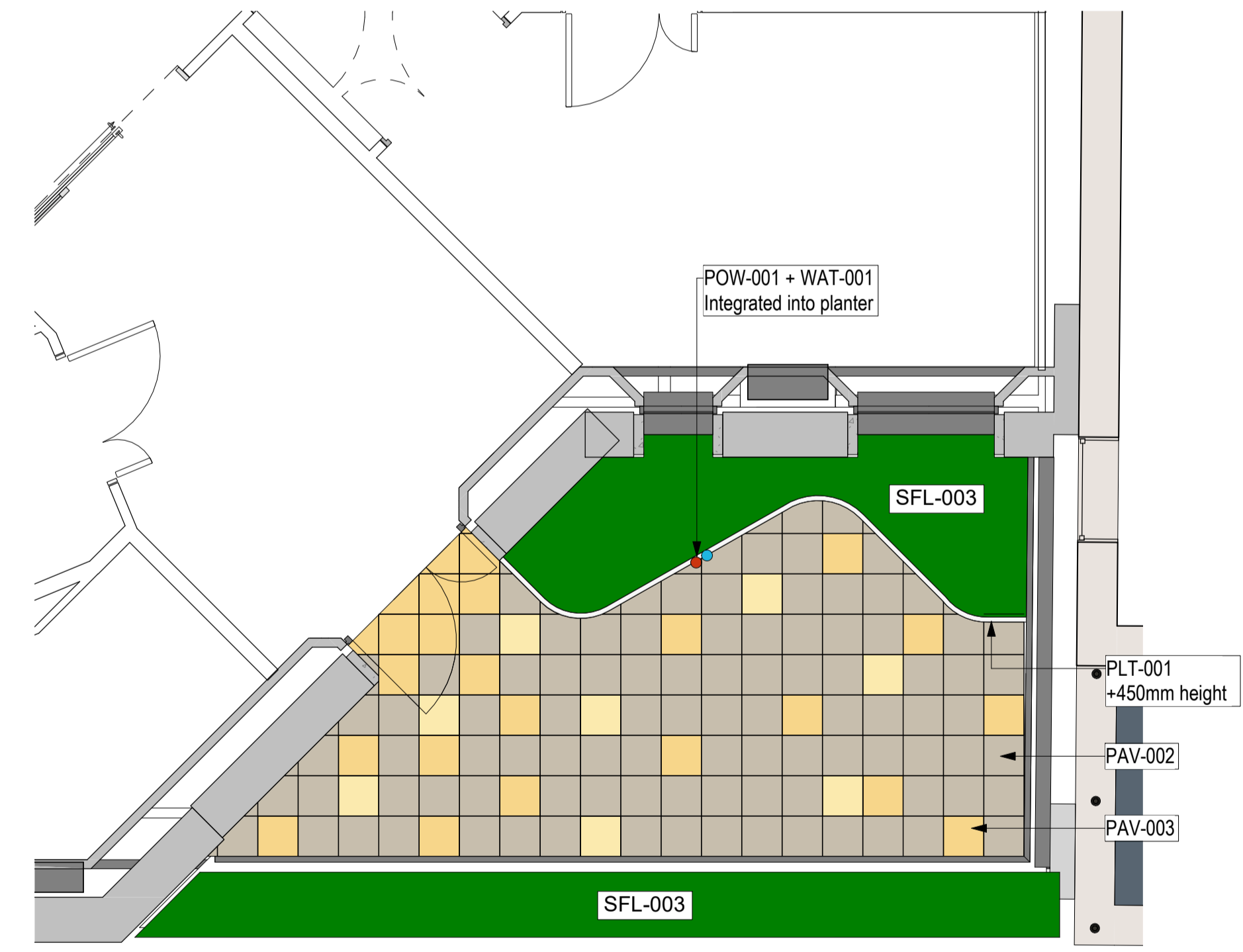
3 Level 6 Palliative Care Terrace 1 : 50