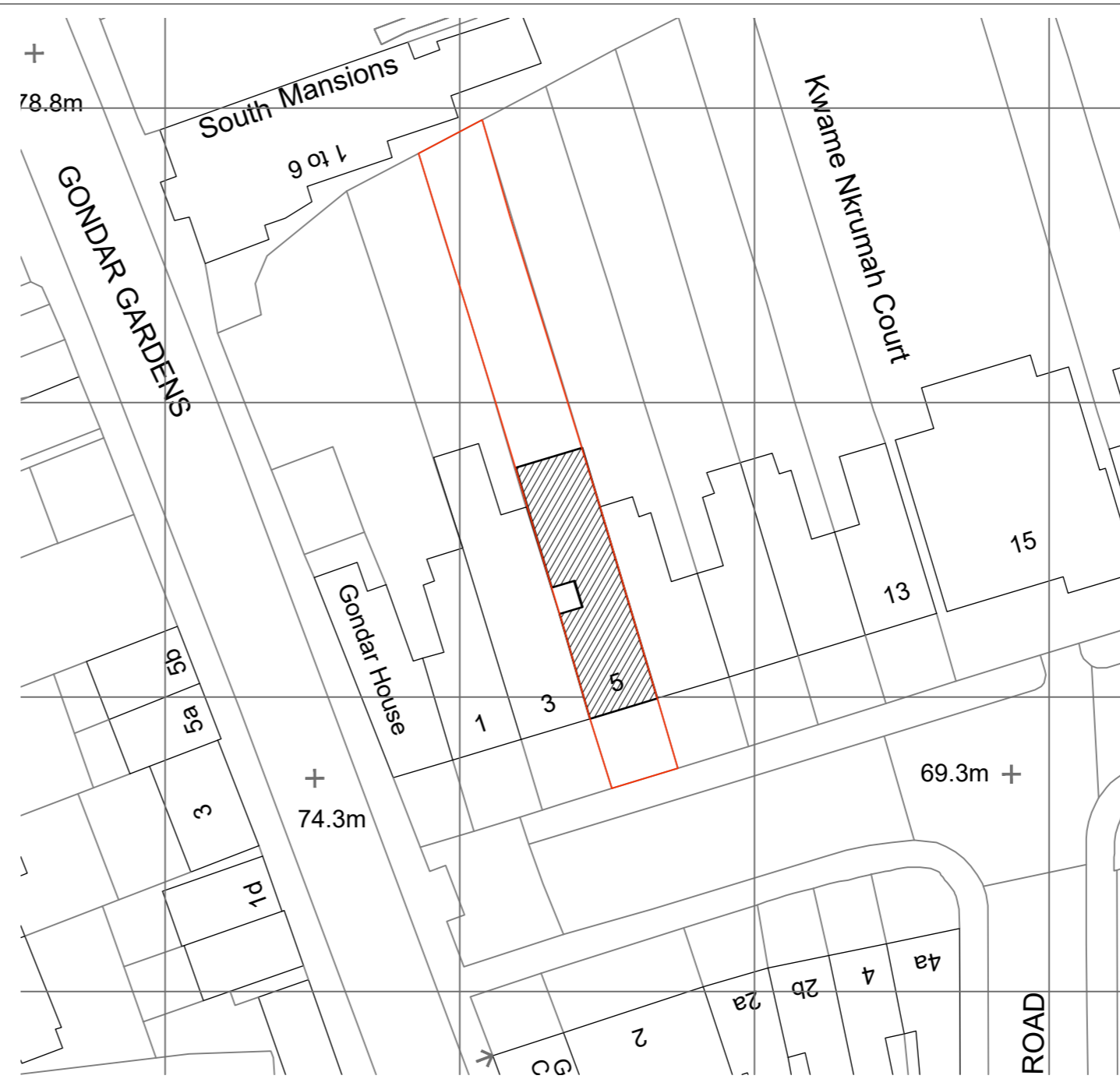
BLOCK PLAN scale 1:500

55-57 Maygrove Road, West Hampstead, London NW6 2EE Phone: +44(0)207 624 6100 Fax: +44(0)207 624 5551 ; info@elevationsltd.co.uk