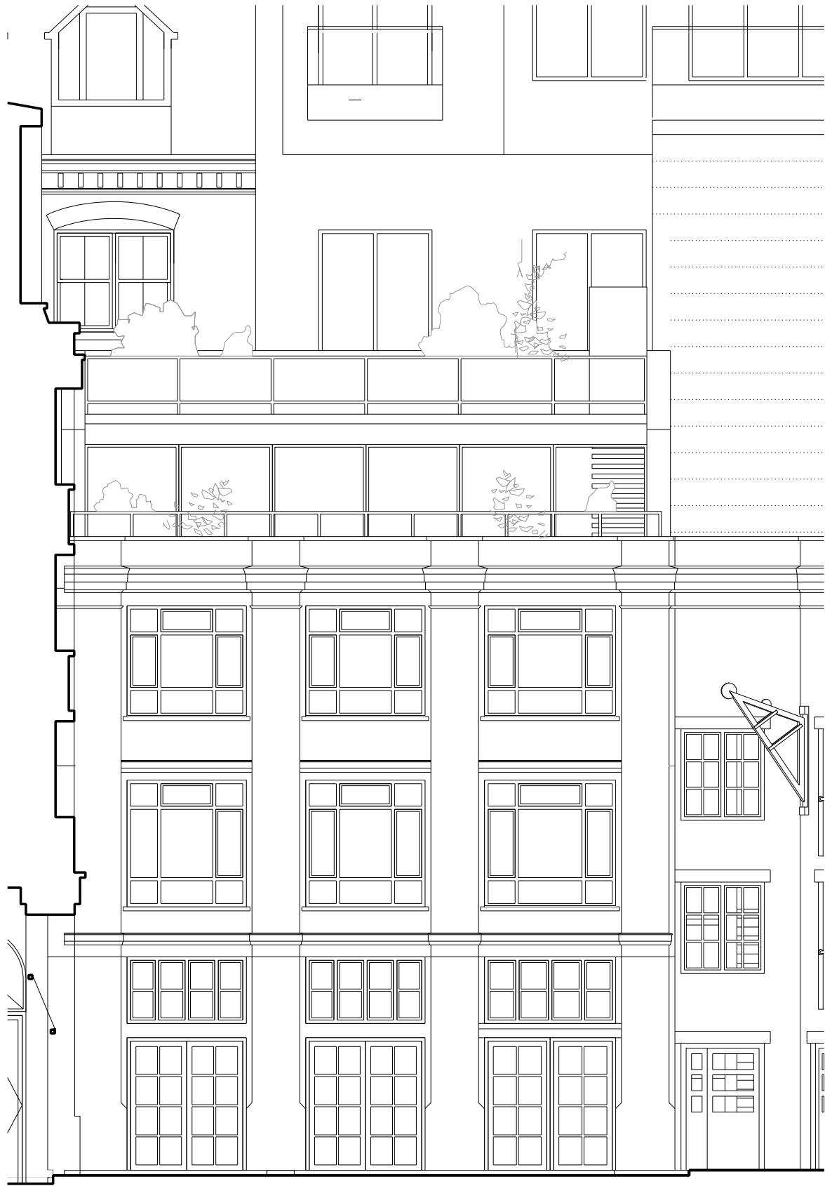
1 EXISTING WEST ELEVATION