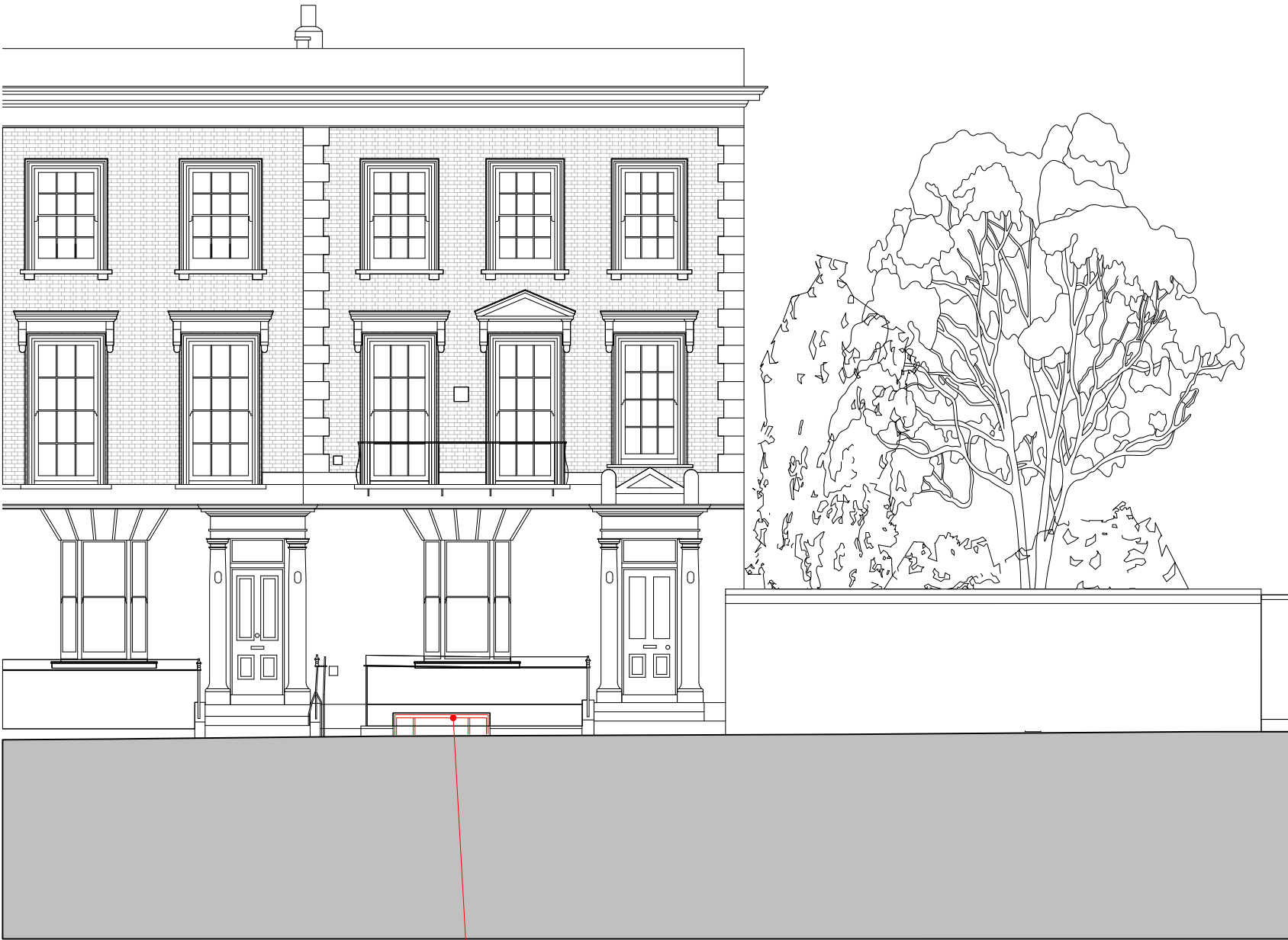
EX Existing Street Elevation 1:100

DEM-LGF-12 (ALTERATION) Replace non-original sash window.