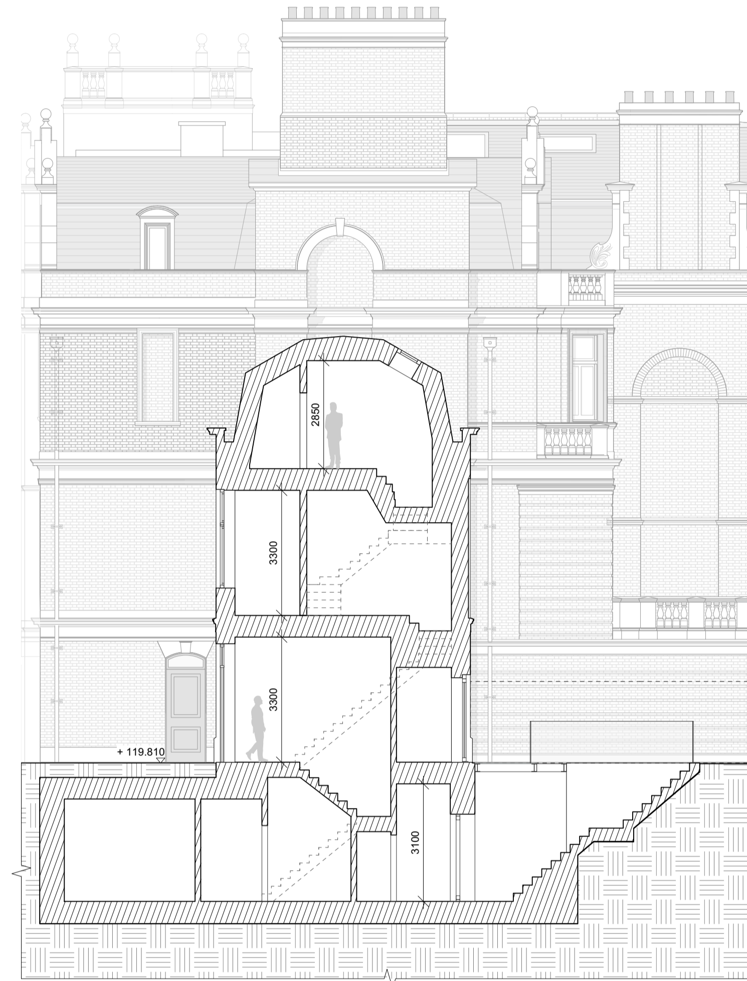
2 PROPOSED SECTION BB Scale: 1:100