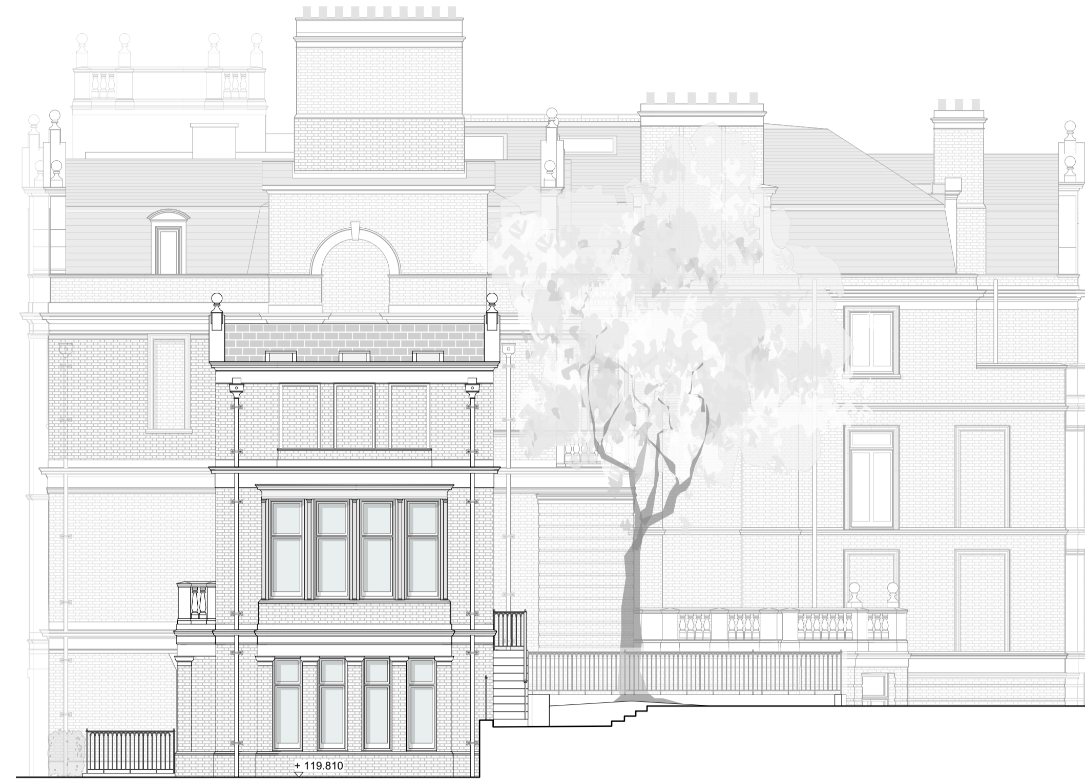
2 PROPOSED NORTH ELEVATION Scale: 1:100