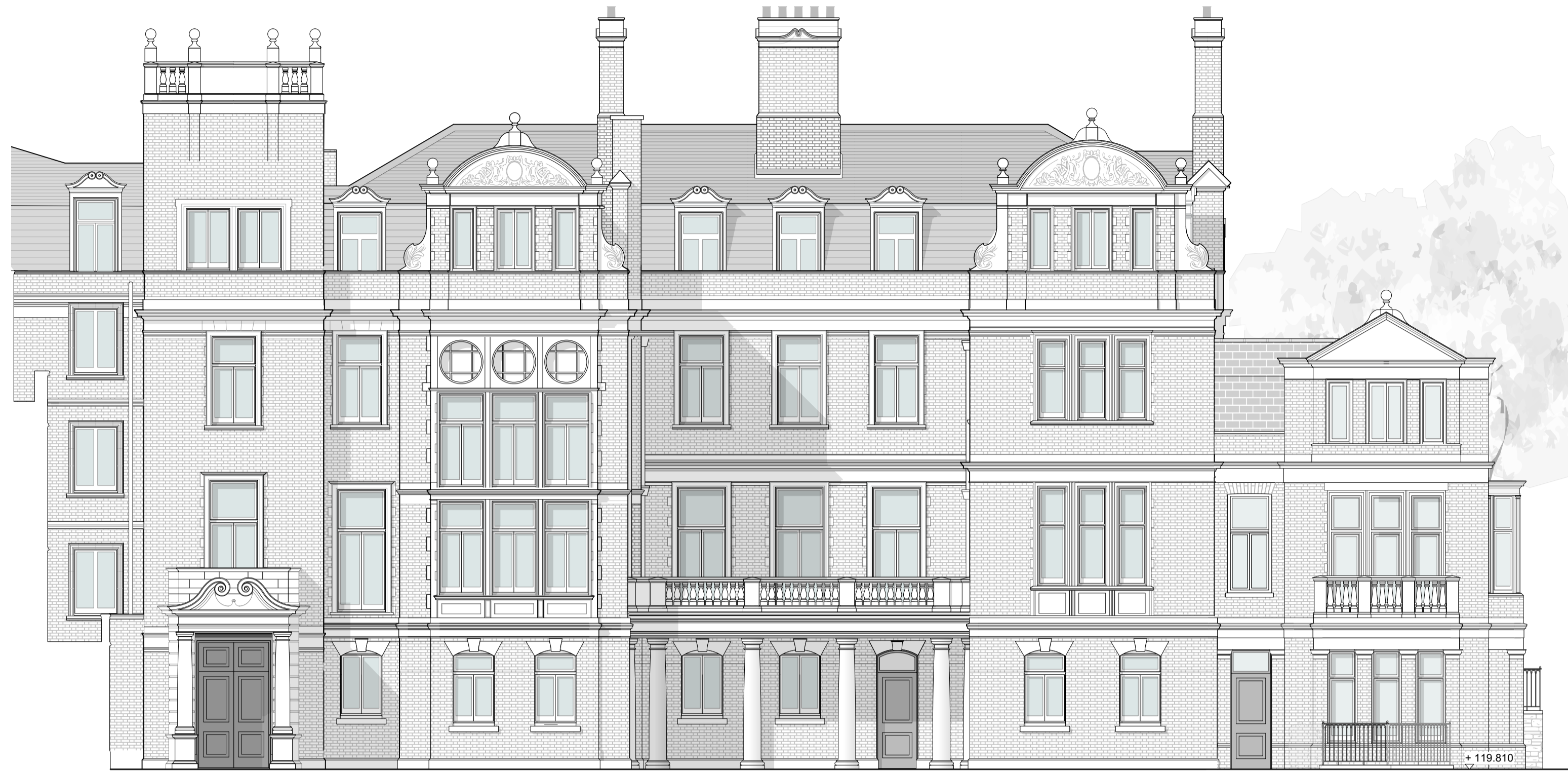
1 PROPOSED EAST ELEVATION Scale: 1:100