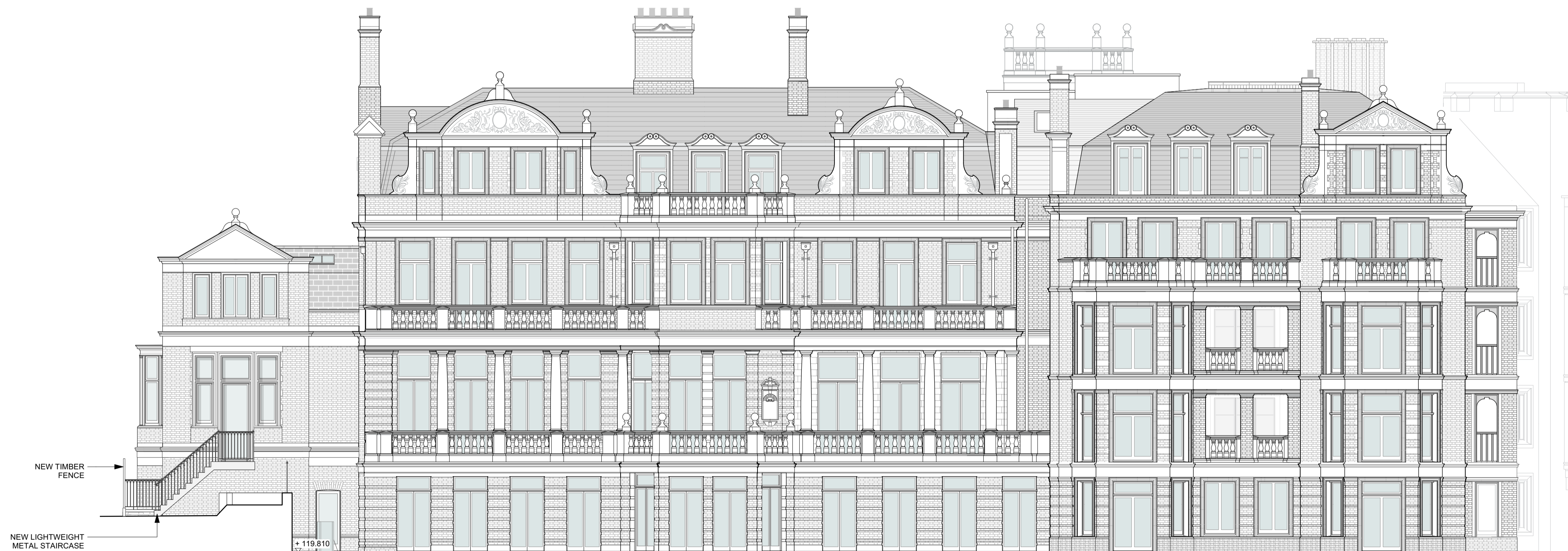
3 PROPOSED WEST ELEVATION Scale: 1:100