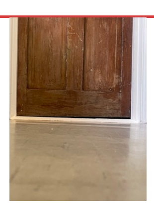
ISSUE 13 Assigned To FD Doors

FED doors to flats could not get access but should be same detail as riser doors