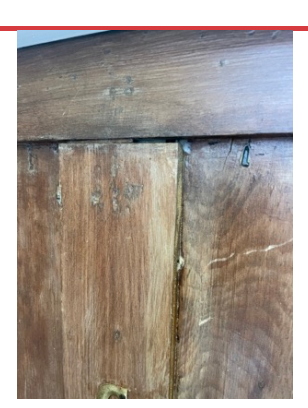
ISSUE 16 Assigned To FD Doors

FED doors to flats could not get access but should be same detail as riser doors