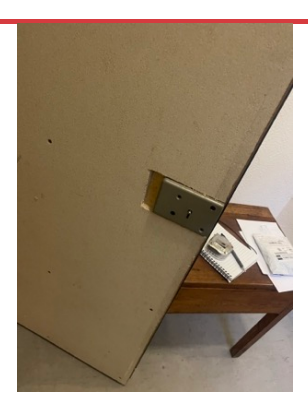
ISSUE 5 Assigned To FD Doors

Behind riser doors big gaps around ironmongery also fitted with dry wall screws