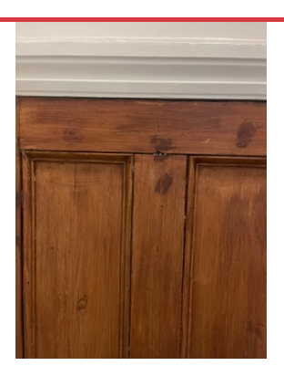
ISSUE 10 Assigned To FD Doors Gaps opening up