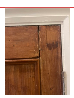
ISSUE 8 Assigned To FD Doors Joins are opening up