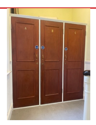
ISSUE 11 Assigned To FD Doors

Top level cupboard doors seem to have been changed seem to be blank FD30 doors with a beading attached for feature had no access for measurements