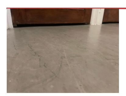
ISSUE 7 Assigned To FD Doors Excessive gaps