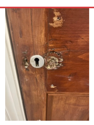
ISSUE 6 Assigned To FD Doors Damages to doors

Behind riser doors big gaps around ironmongery also fitted with dry wall screws