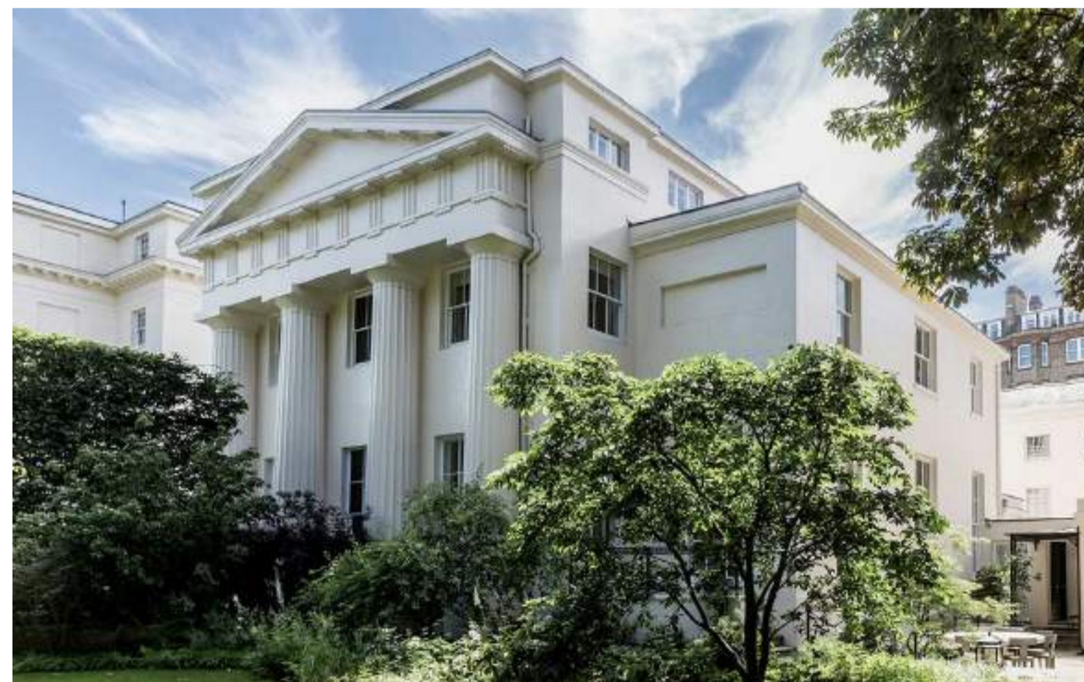
EXAMPLES OF PAINTED VILLAS IN ST JOHN'S WOOD AND SURROUNDINGS FROM WHICH THE PROPOSAL AT 52 AVENUE ROAD TAKES ITS CUE.