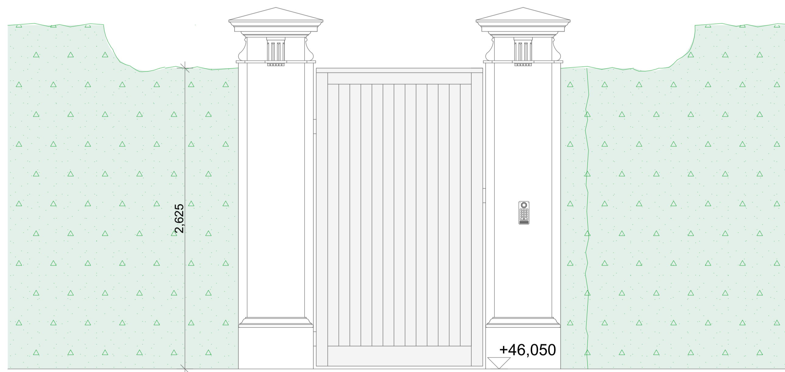
ELEVATION OF PEDESTRIAN GATE 1:20