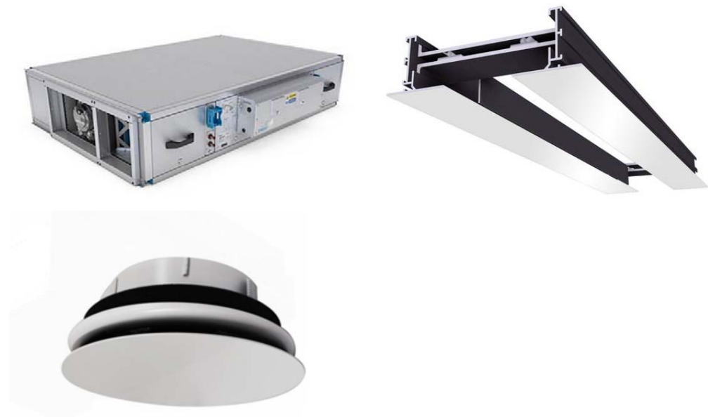
Figure 7: Example commercial horizontal MVHR unit with heat recovery, supply/extract diffuser and disc valve

MVHR units serving landlord areas will operate on a CO2 and presence detector controls and will interface with the BMS for run / fault status.