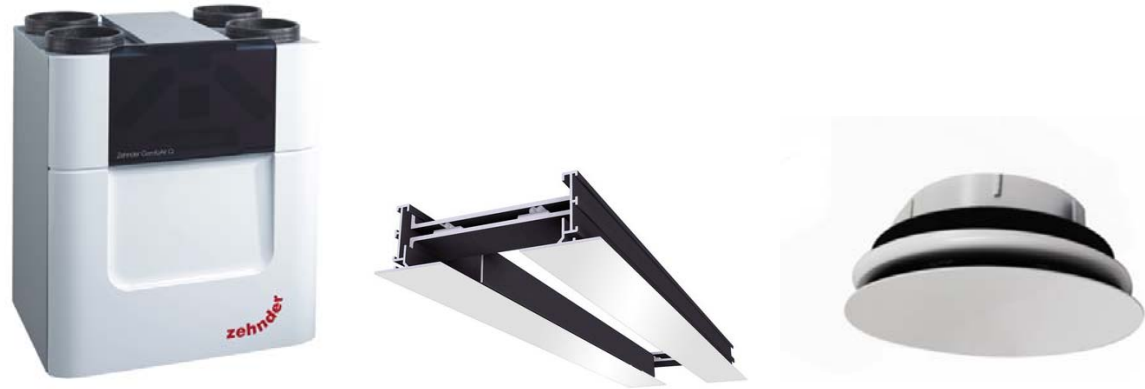
Figure 4: Example horizontal MVHR unit , linear supply/extract diffuser and disc valve

Each townhouse will be mechanically ventilated via 4No. wall mounted residential high efficiency mechanical ventilation heat recovery (MVHR) units. Fresh air supply ductwork will distribute from the MVHR units to supply to all the habitable rooms and extract ductwork will provide extract to all the toilets and kitchens. All MVHR will be supplied with electrical heating coils. Individual MVHR controls will be linked to townhouse BMS or AV system to monitor for MVHR fault signals. Fresh air will be supplied and extracted from different areas via number of linear diffusers and/or ventilation valves (this will be coordinated with the architect and interior designer at next design stage)