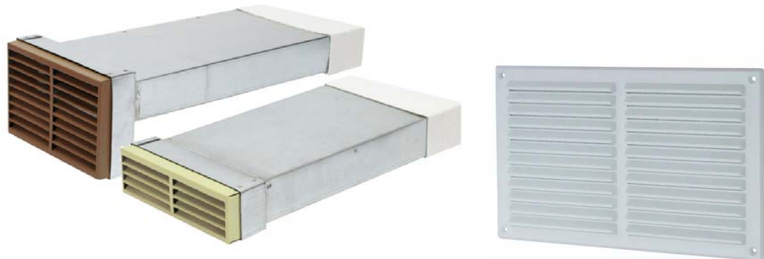
Figure 5: Example of fire rated ductwork connections to facade for residential intake & exhaust ventilation and supply/exhaust louvre

Intake and exhaust ductwork will extend to external air bricks or louvres on facades or roof cowls. Ductwork connections to the façade will be fire rated and insulated to comply with Building Regulations. Attenuation will be provided to all duct connections to and from the MVHR unit.