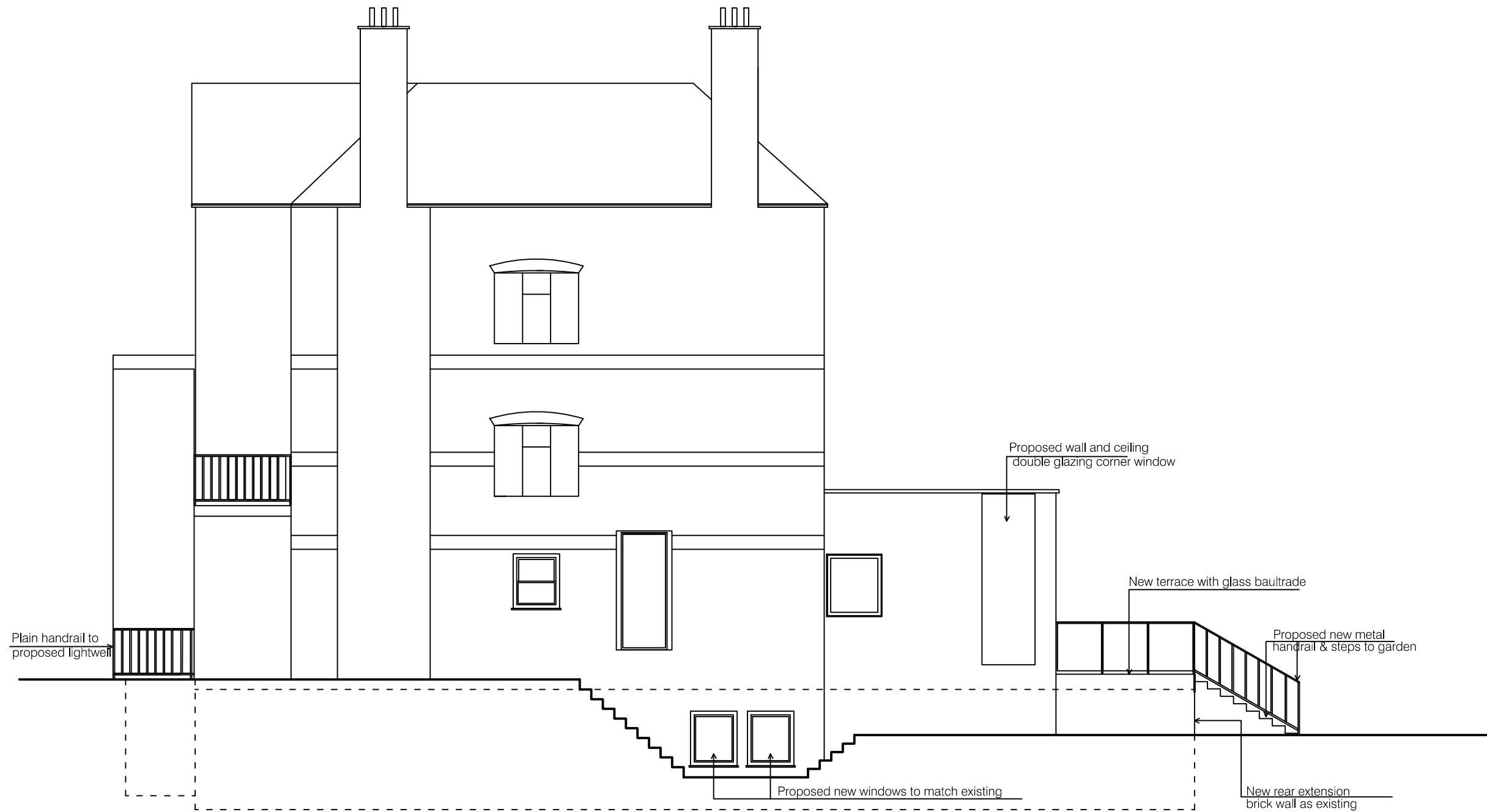
SITE ELEVATION/ ALLEY AS PROPOSED