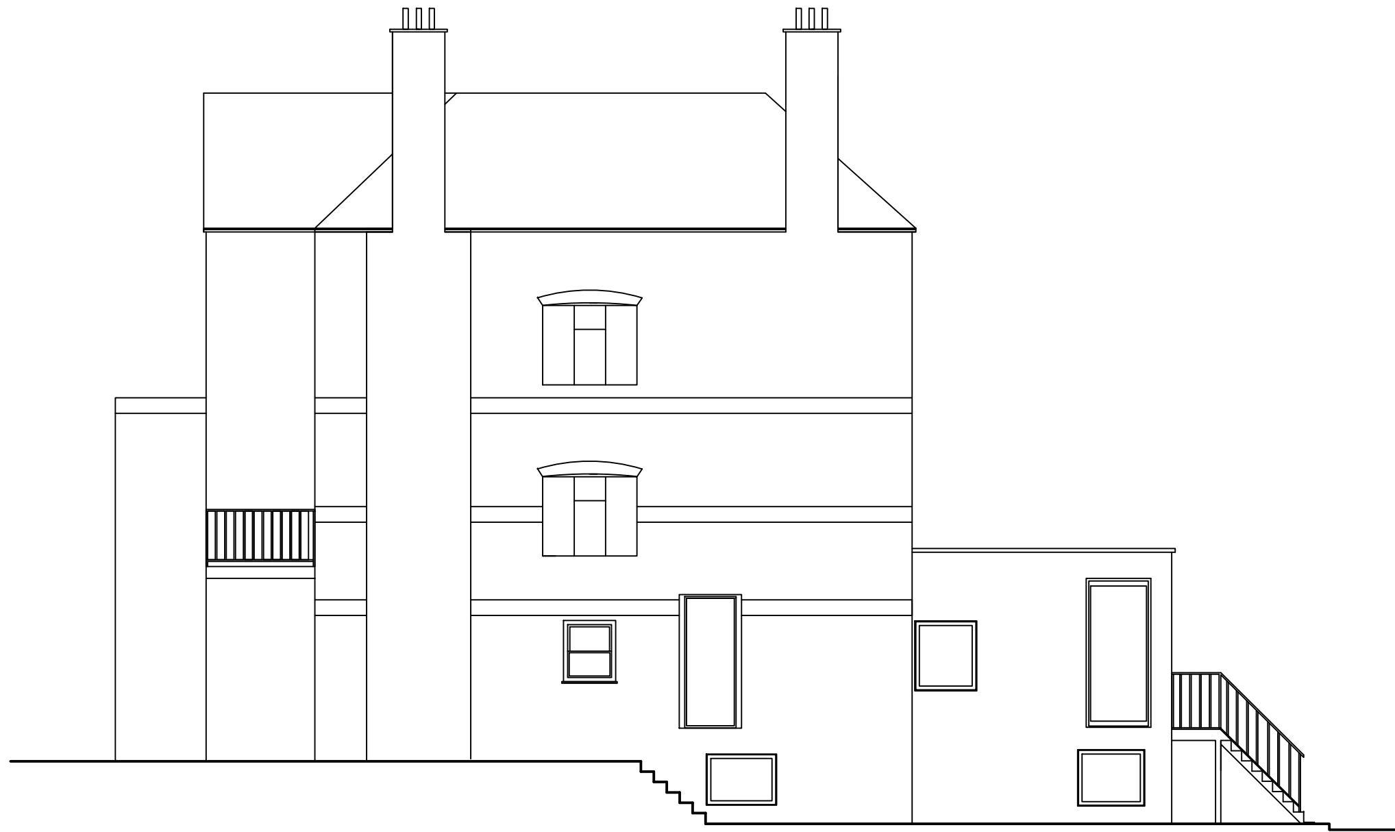
SITE ELEVATION/ ALLEY AS EXISTING