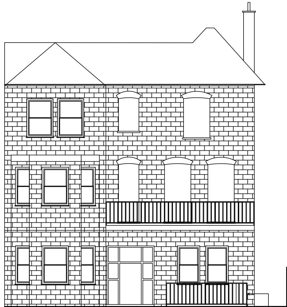
FRONT ELEVATION AS EXISTING ( flat 2)