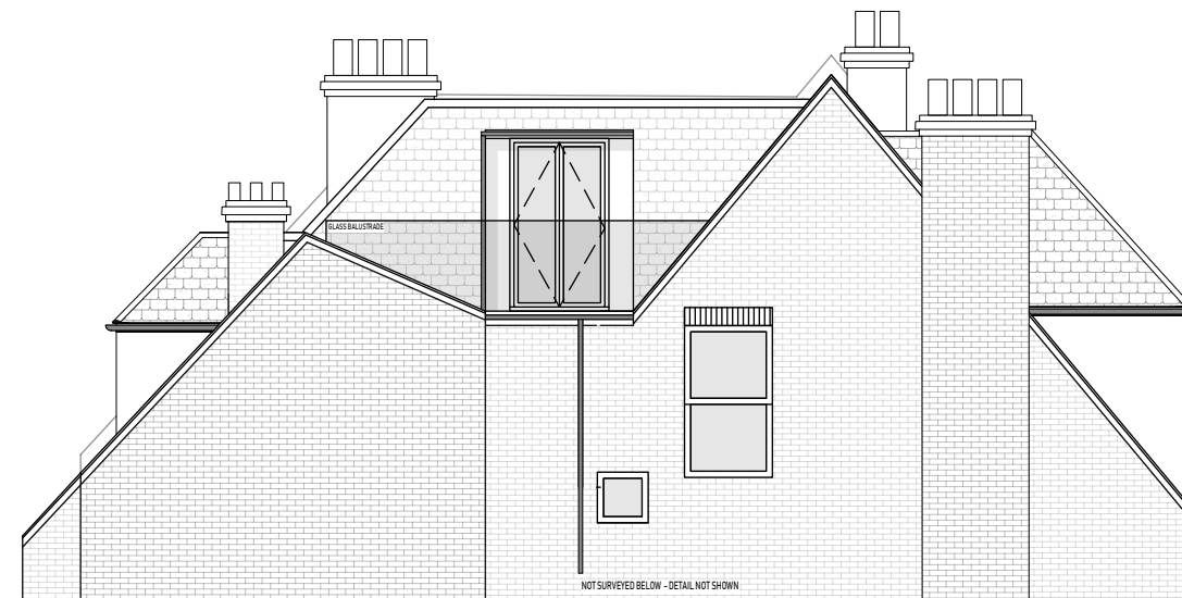
03 SIDE ELEVATION Scale: 1:100