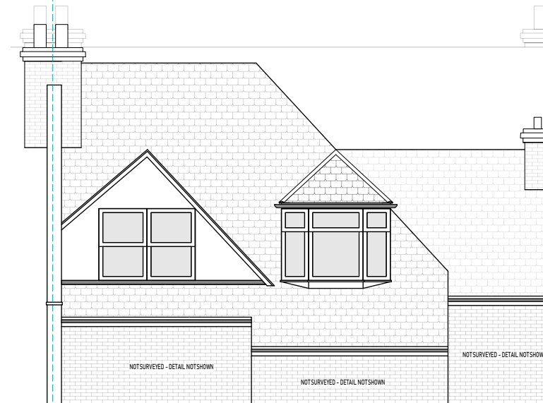
02 FRONT ELEVATION Scale: 1:100