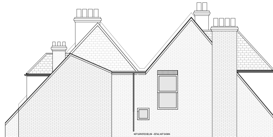
03 SIDE ELEVATION Scale: 1:100