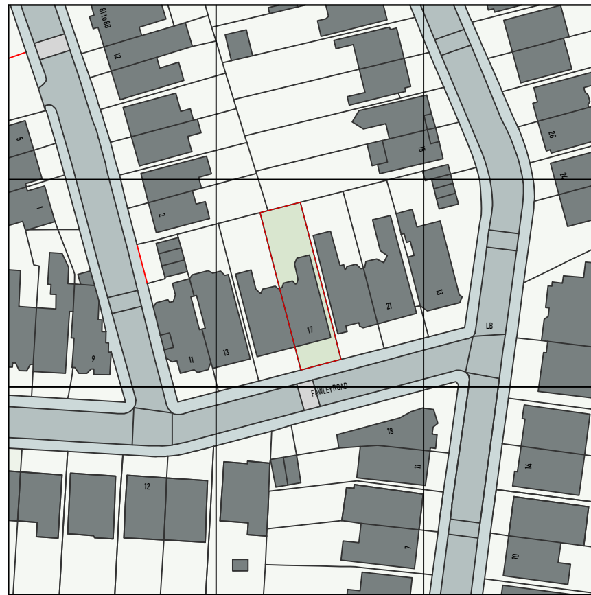
01 LOCATION PLAN Scale: 1:1250