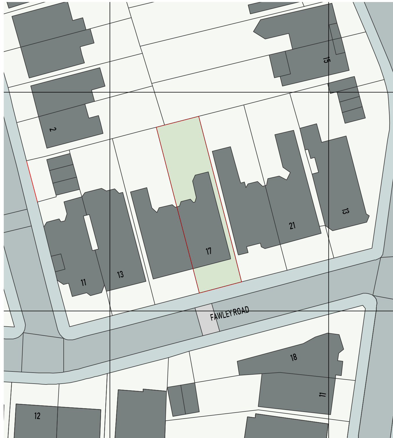
02 BLOCK PLAN Scale: 1:500