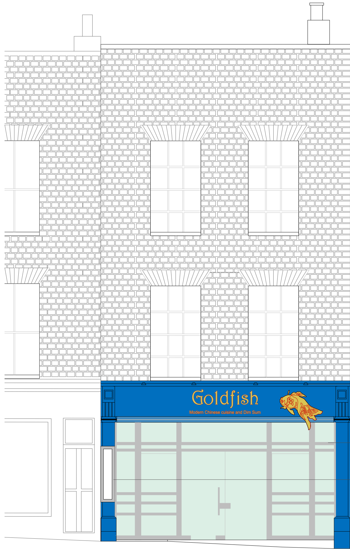
EXISTING FACADE DESIGN 1:50