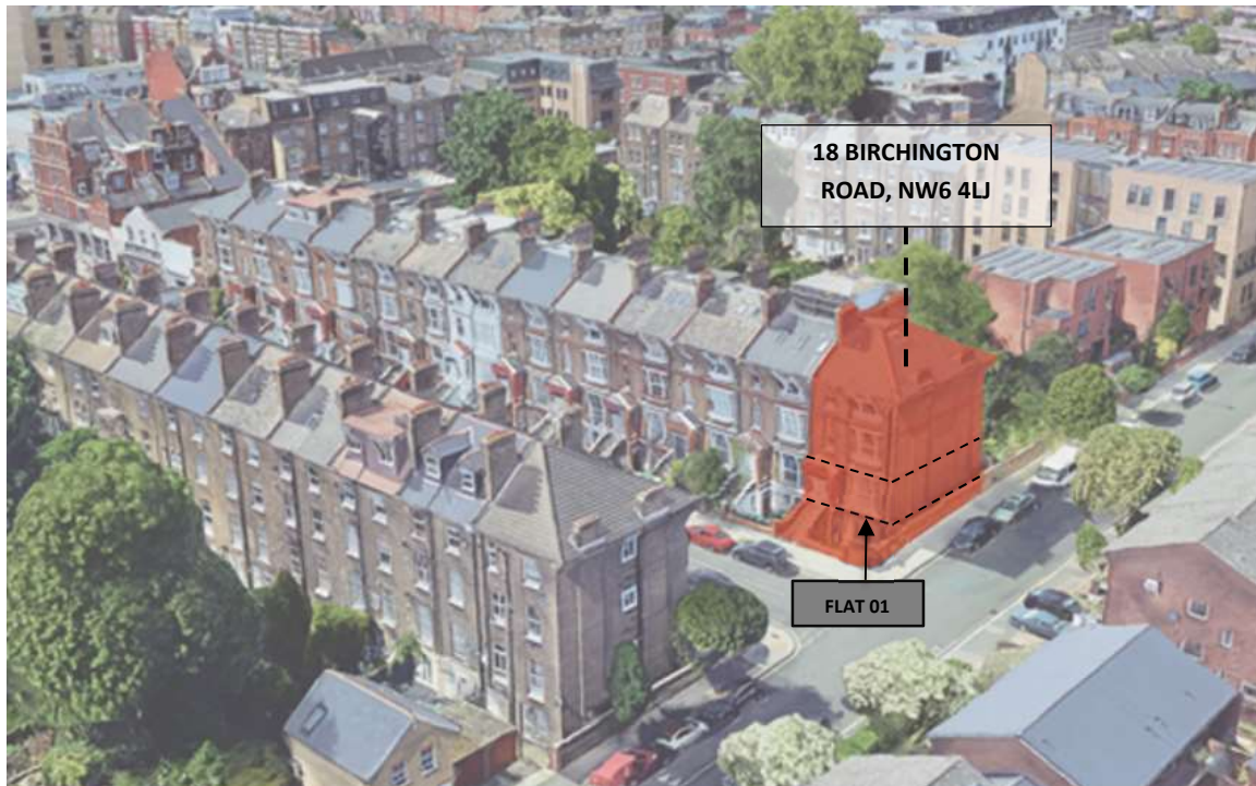
Figure. 2 - Flat 1 Location