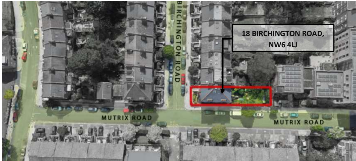
Figure. 1 - Location area

The building is not listed, nor it is located within a conservation area.