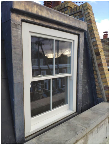
Rolled lead dormer example image

2 Dormer and Roof Material 603 Scale 1:20@A3