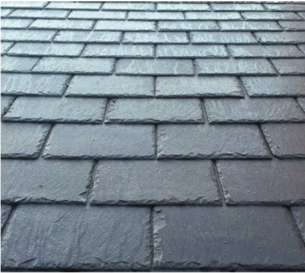
Reclaimed Welsh slates for roof