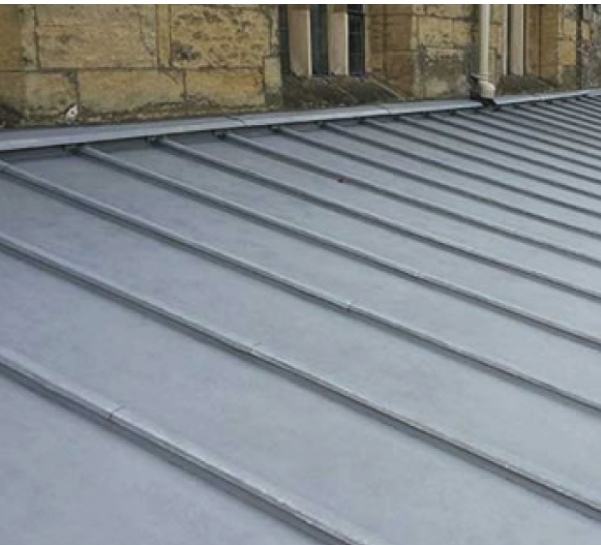
Rolled lead roof construction