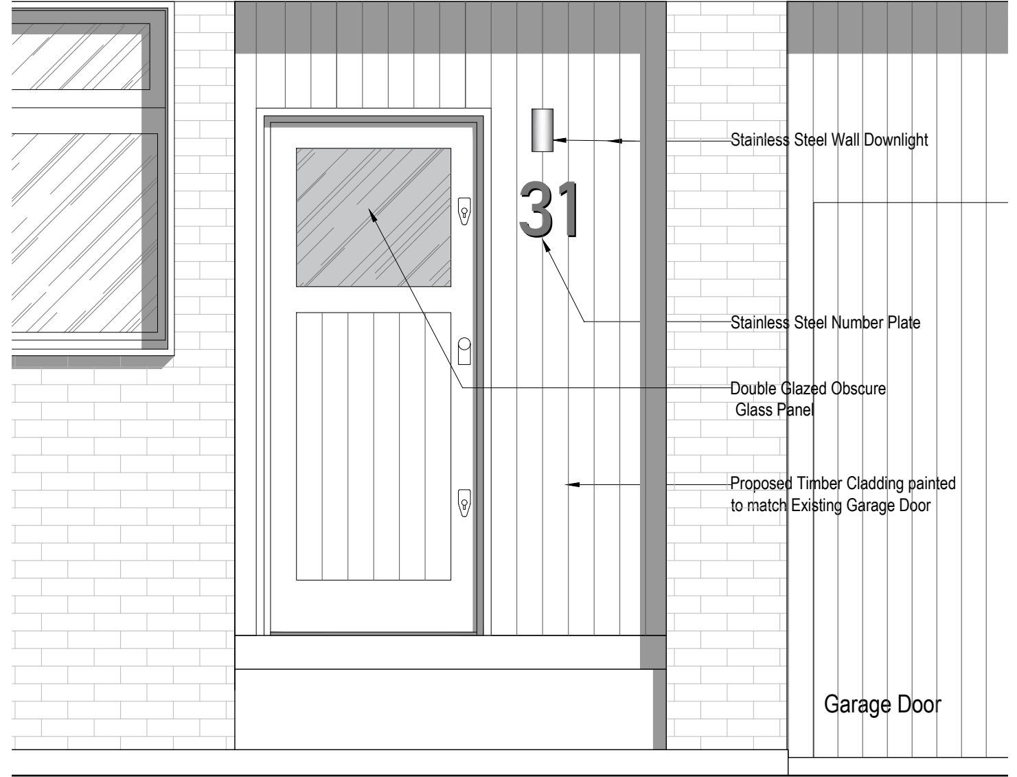
Proposed Rear Entrance Door Elevation Scale 1:20 @ A3