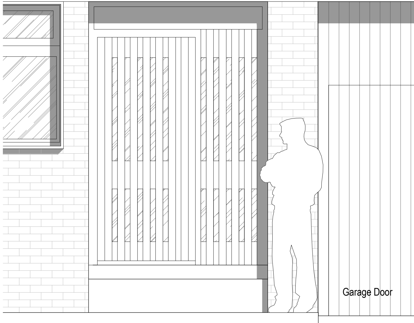
Existing Rear Entrance Door Elevation Scale 1:20 @ A3