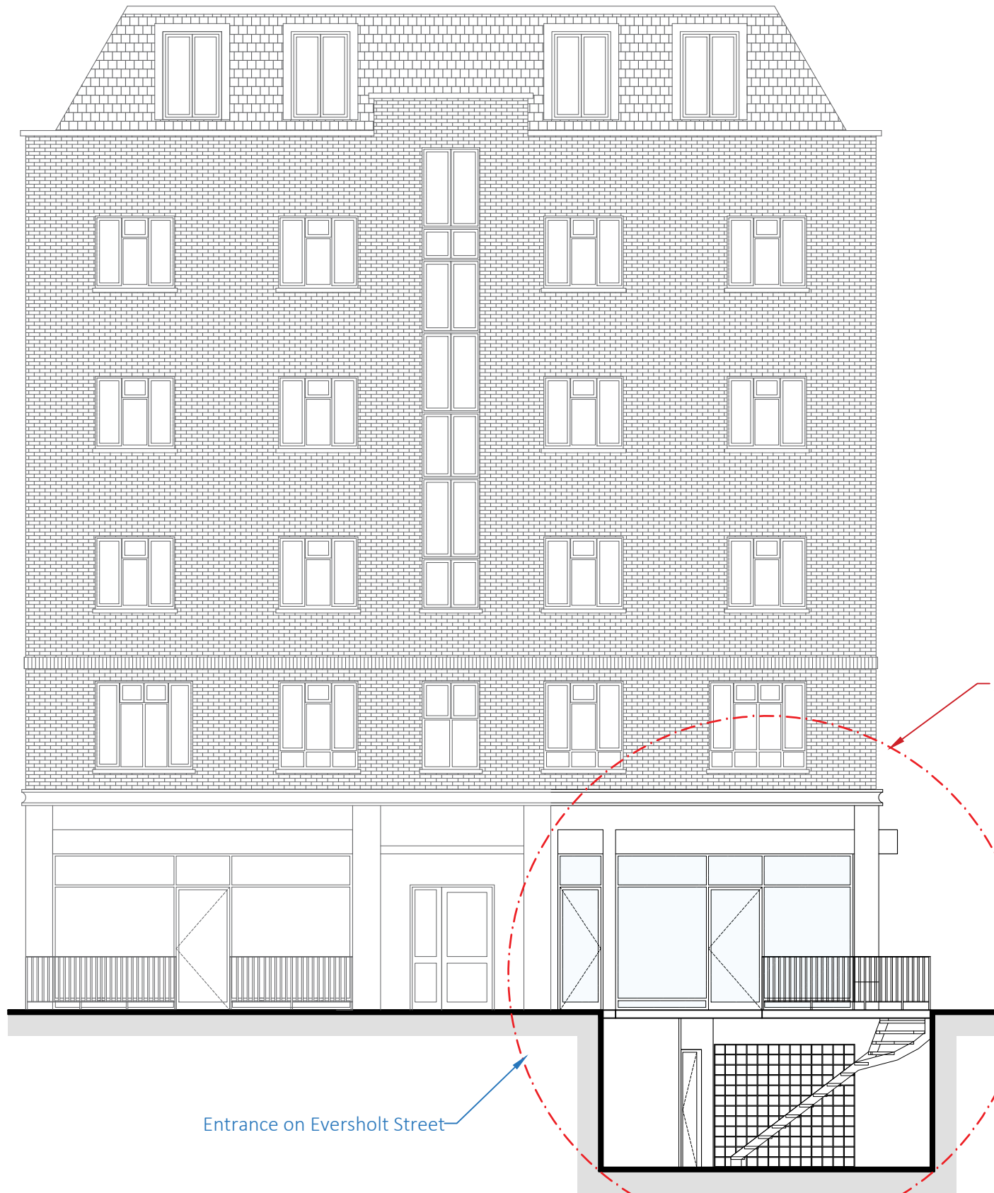
EXISTING SOUTH-WEST ELEVATION