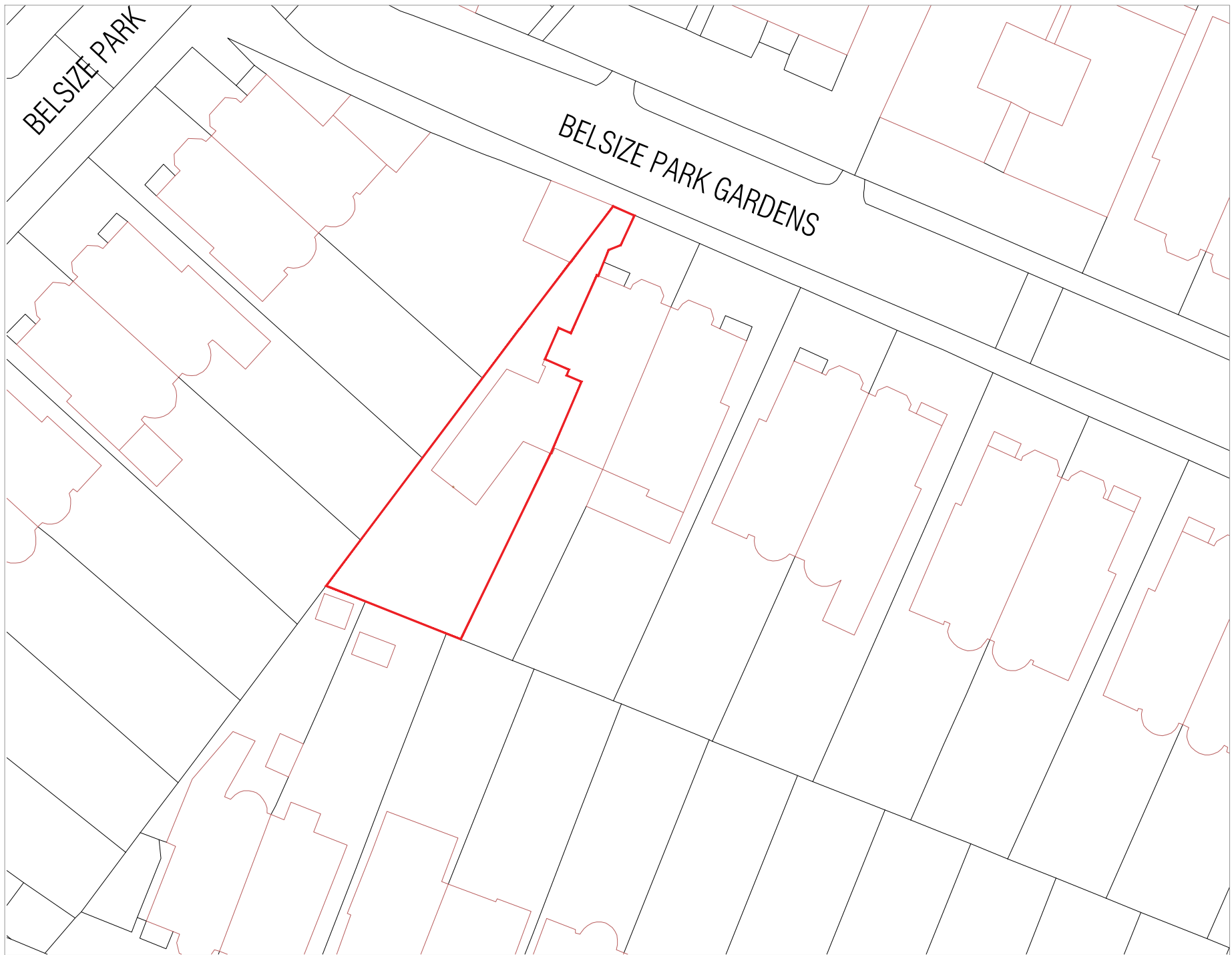
02 Drawing 02 - Site Plan Scale 1:500 @ A1