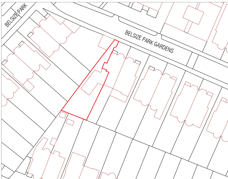
01 Drawing 01 - Location Plan Scale 1:1250 @ A1