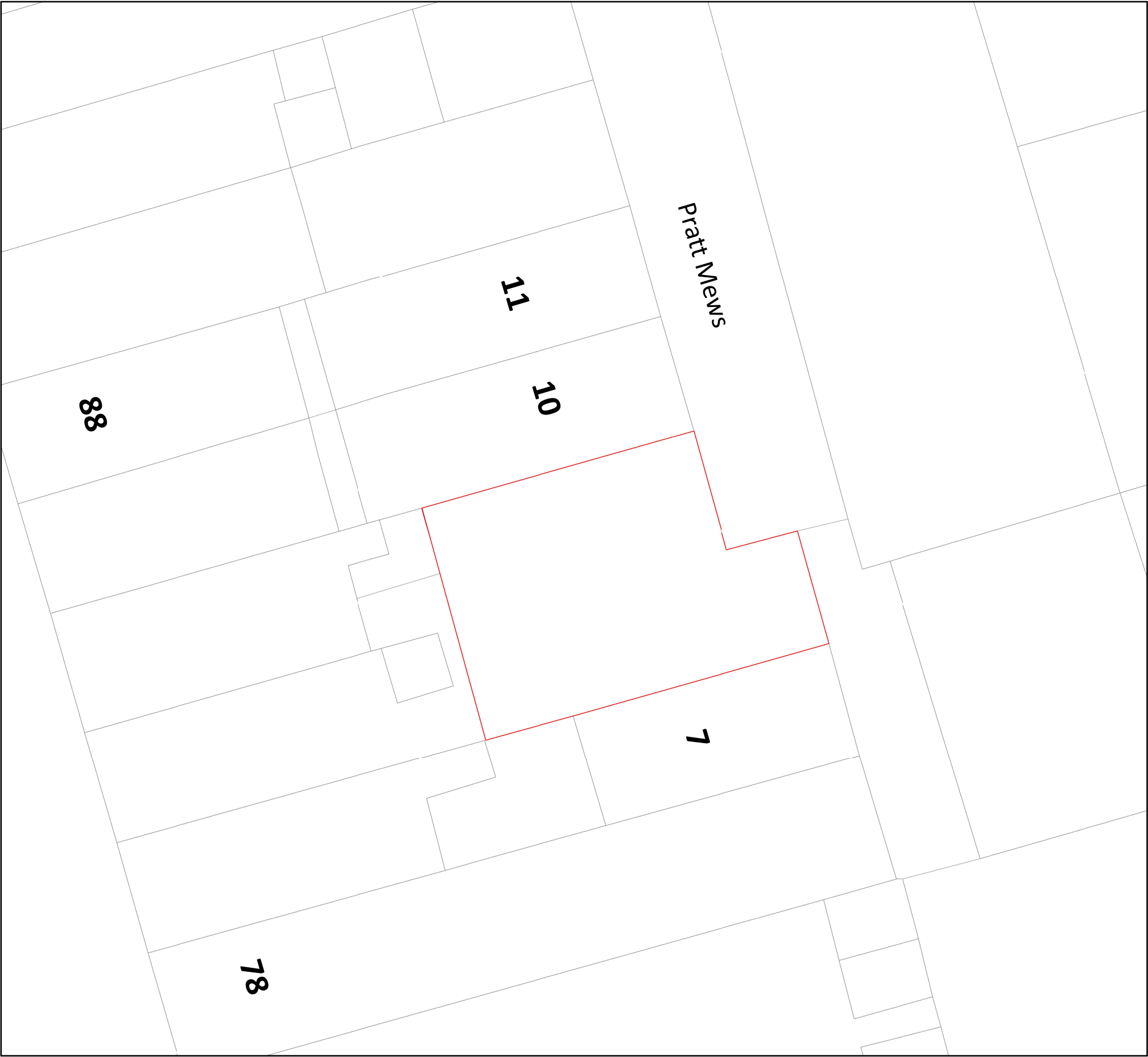
LOCATION PLAN (Scale 1:1250)