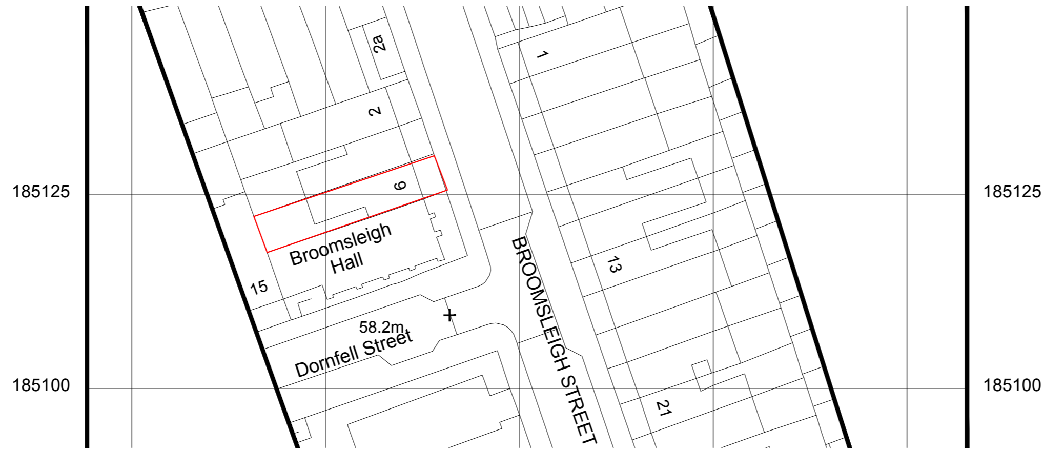
SITE BLOCK PLAN 1:500