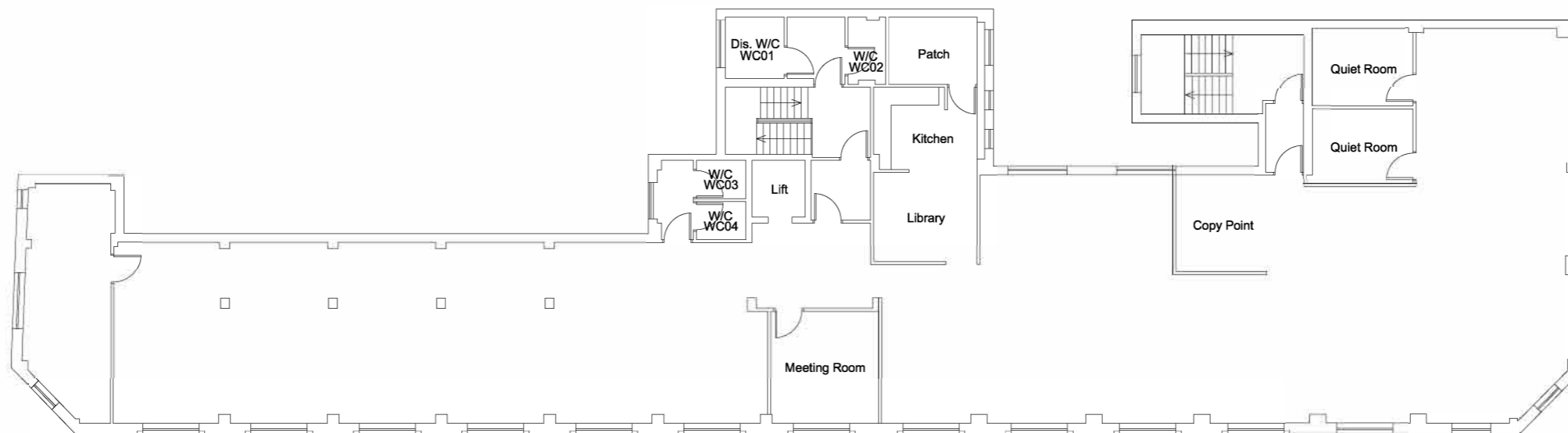
Alternative Use (office) - Third Floor Plan