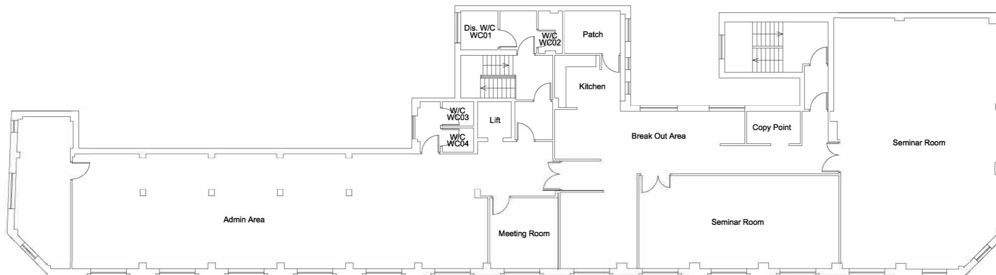
Existing Use (education) - Third Floor Plan