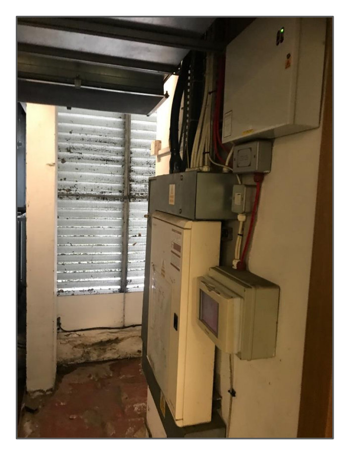
Mechanical Plant Room No 2 Basement 7 -15 Whitfield Street development