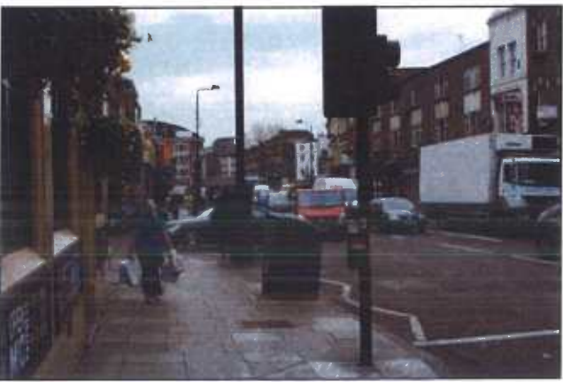
Camden High Street (no furniture)