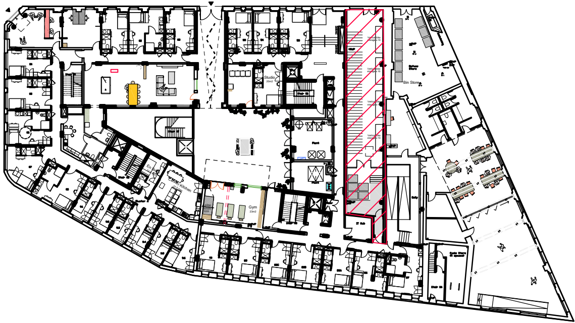
KEY LOCATION PLAN 1:500

DO NOT SCALE FROM THIS DRAWING. VERIFY ALL DIMENSIONS AND SETTING OUT ON SITE. NOTIFY ANY DISCREPANCIES TO THE ARCHITECT. FOR STRUCTURAL INFORMATION, REFER TO STRUCTURAL ENGINEER'S DRAWINGS. FOR M&E INFORMATION, REFER TO M&E ENGINEER'S AND SUB-CONTRACTOR'S DRAWINGS. FOR HEALTH & SAFETY INFORMATION, REFER TO HEALTH & SAFETY RISK ASSESSMENTS.