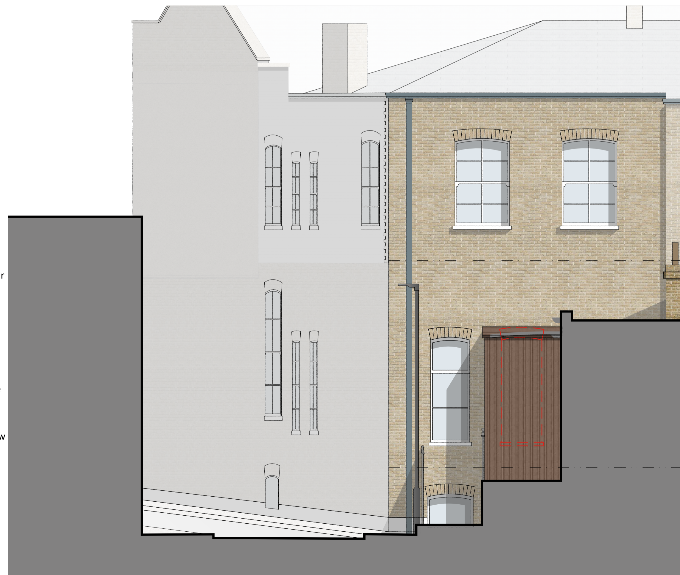
SECTION B AS PROPOSED