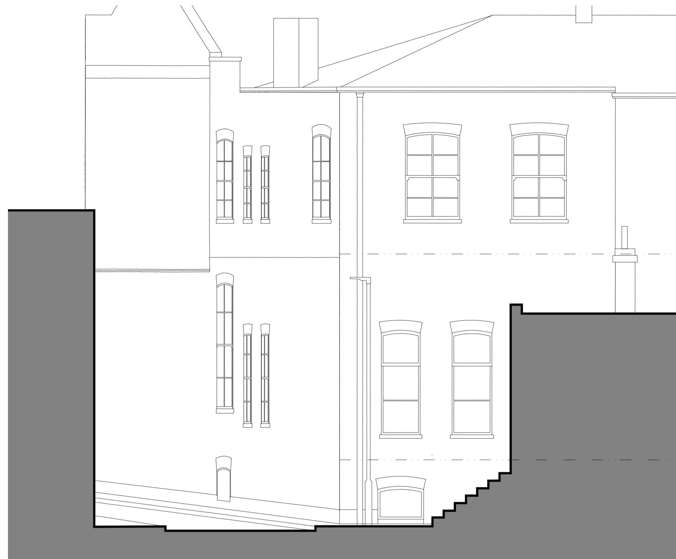
SECTION B AS EXISTING