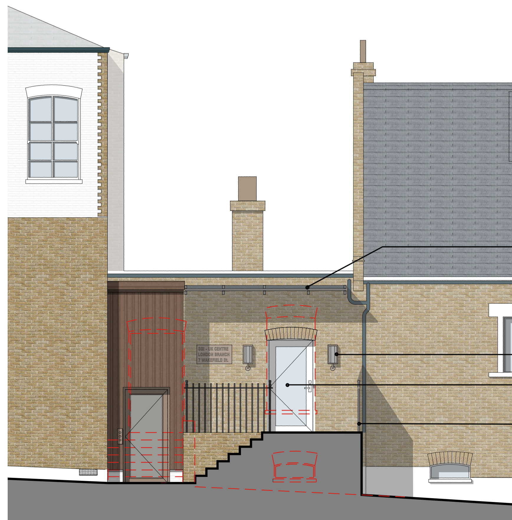
SECTION A AS PROPOSED