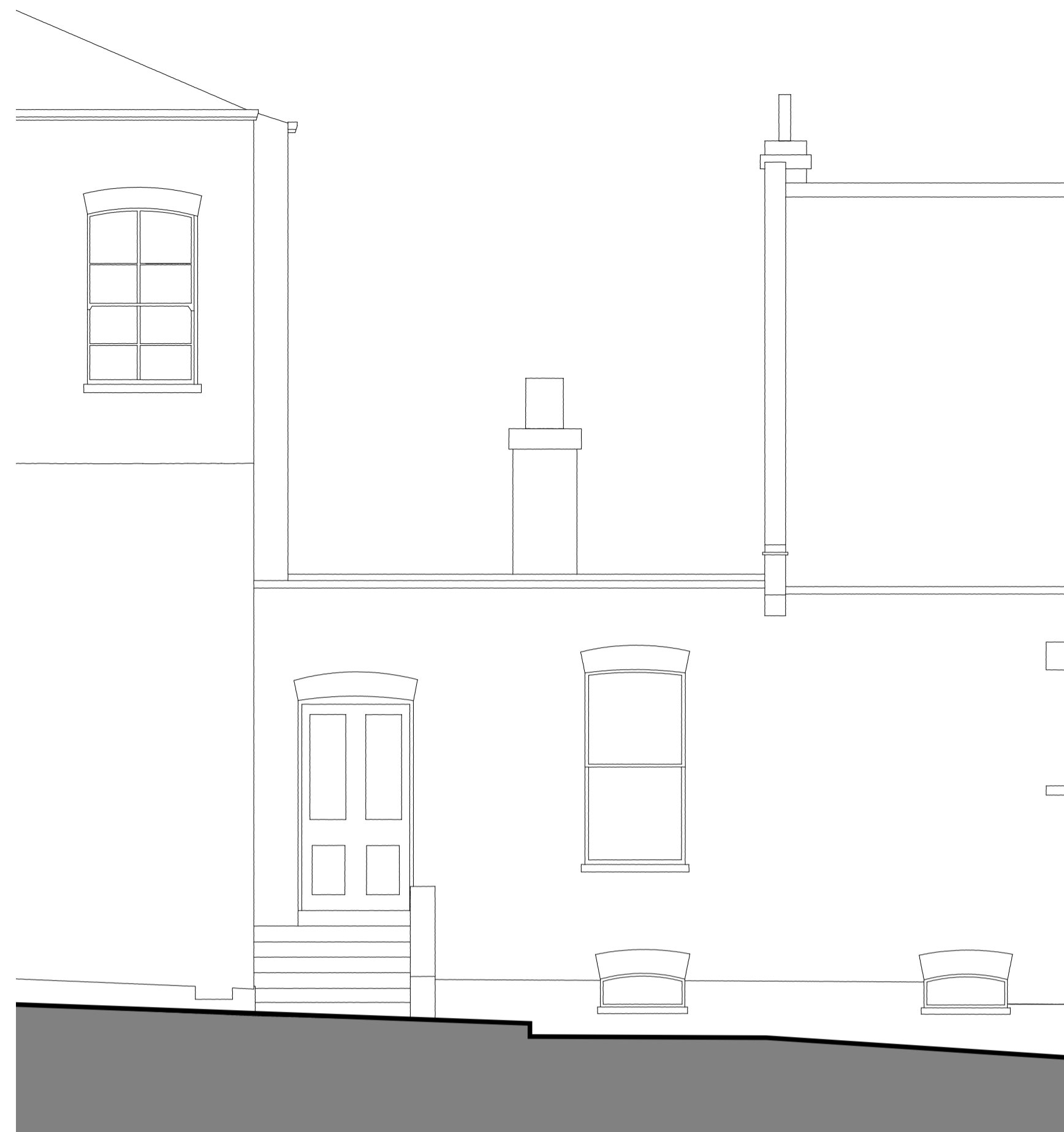
SECTION A AS EXISTING