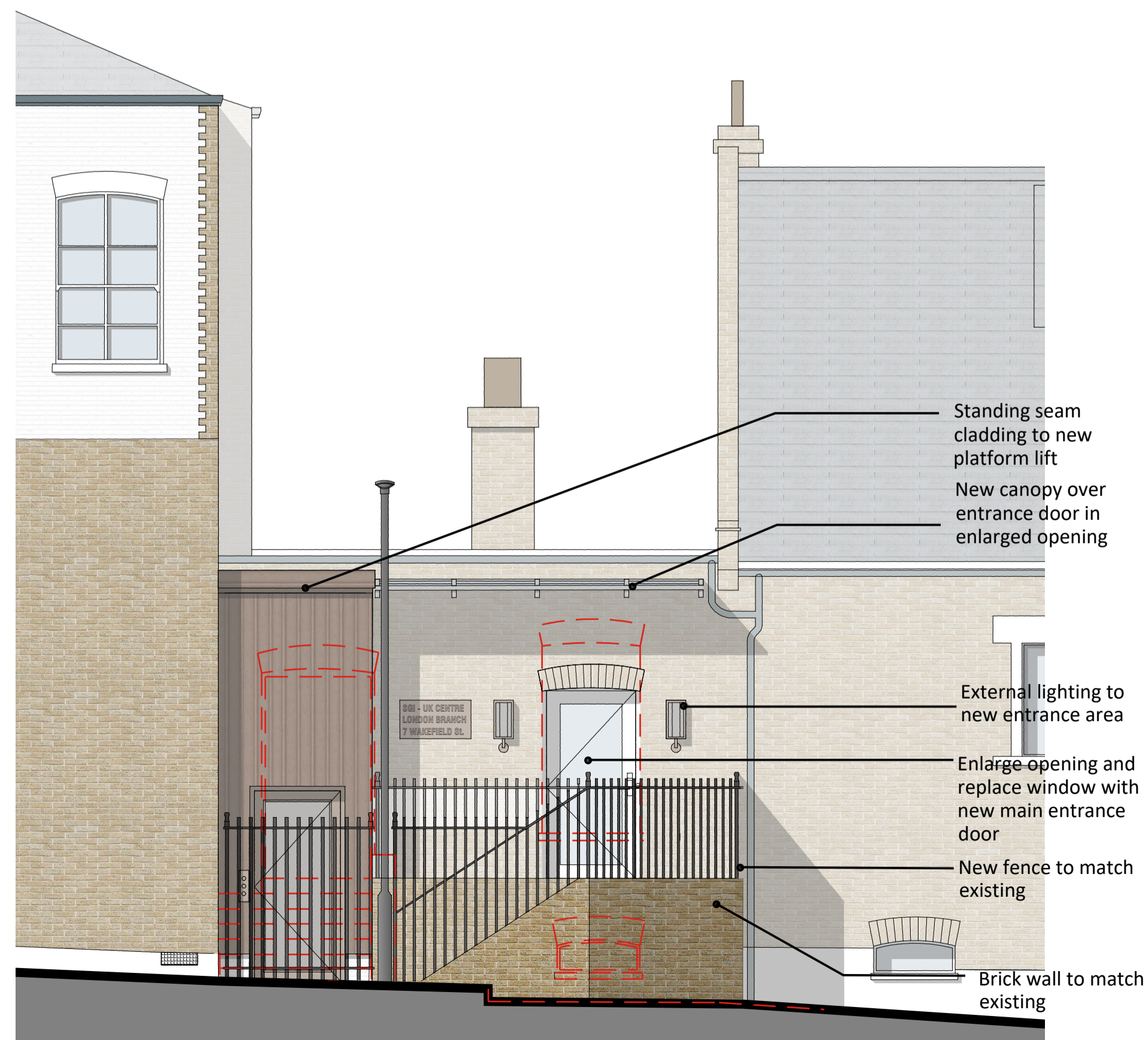
ELEVATION A AS PROPOSED