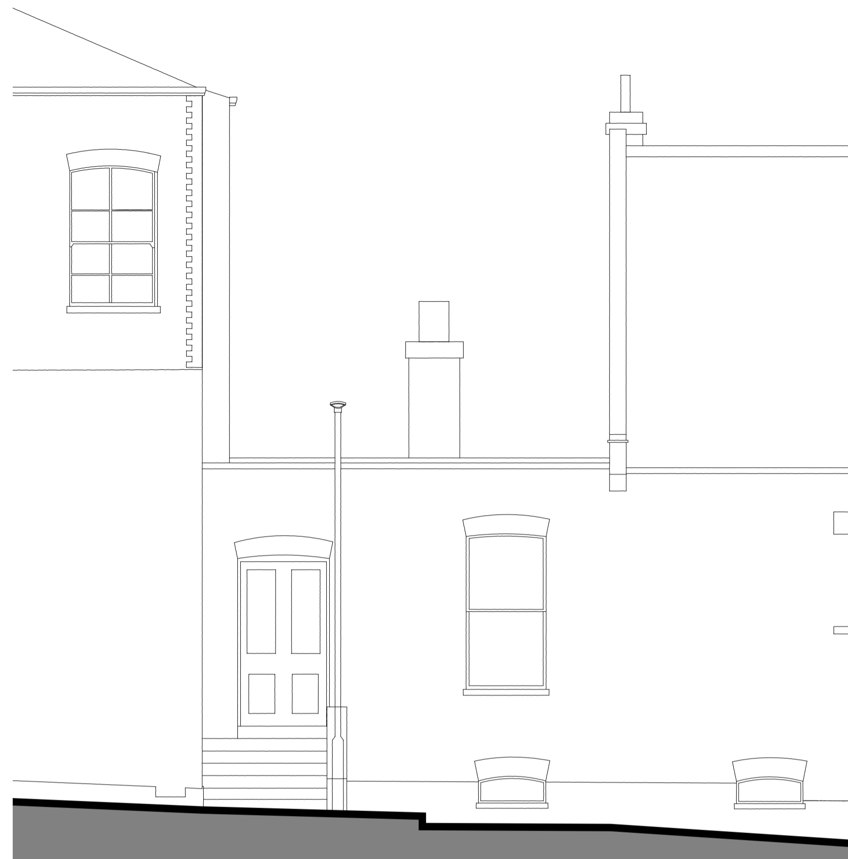
ELEVATION A AS EXISTING