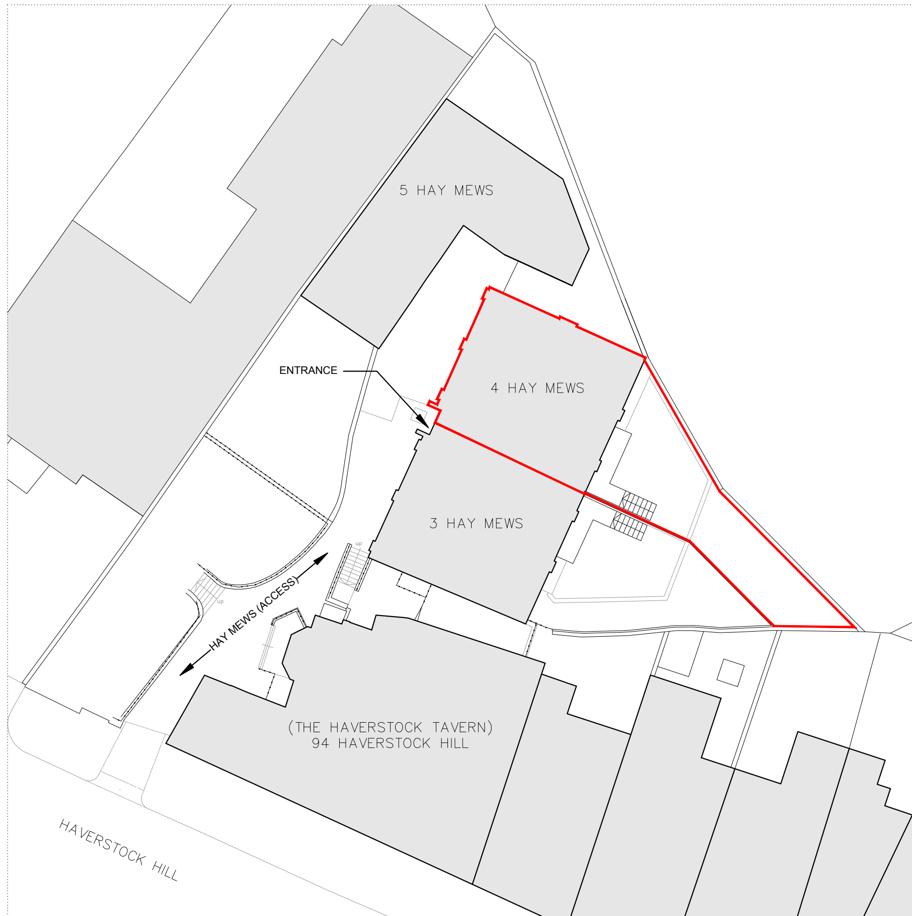
A | BLOCK PLAN SCALE @ 1:200 (A3)