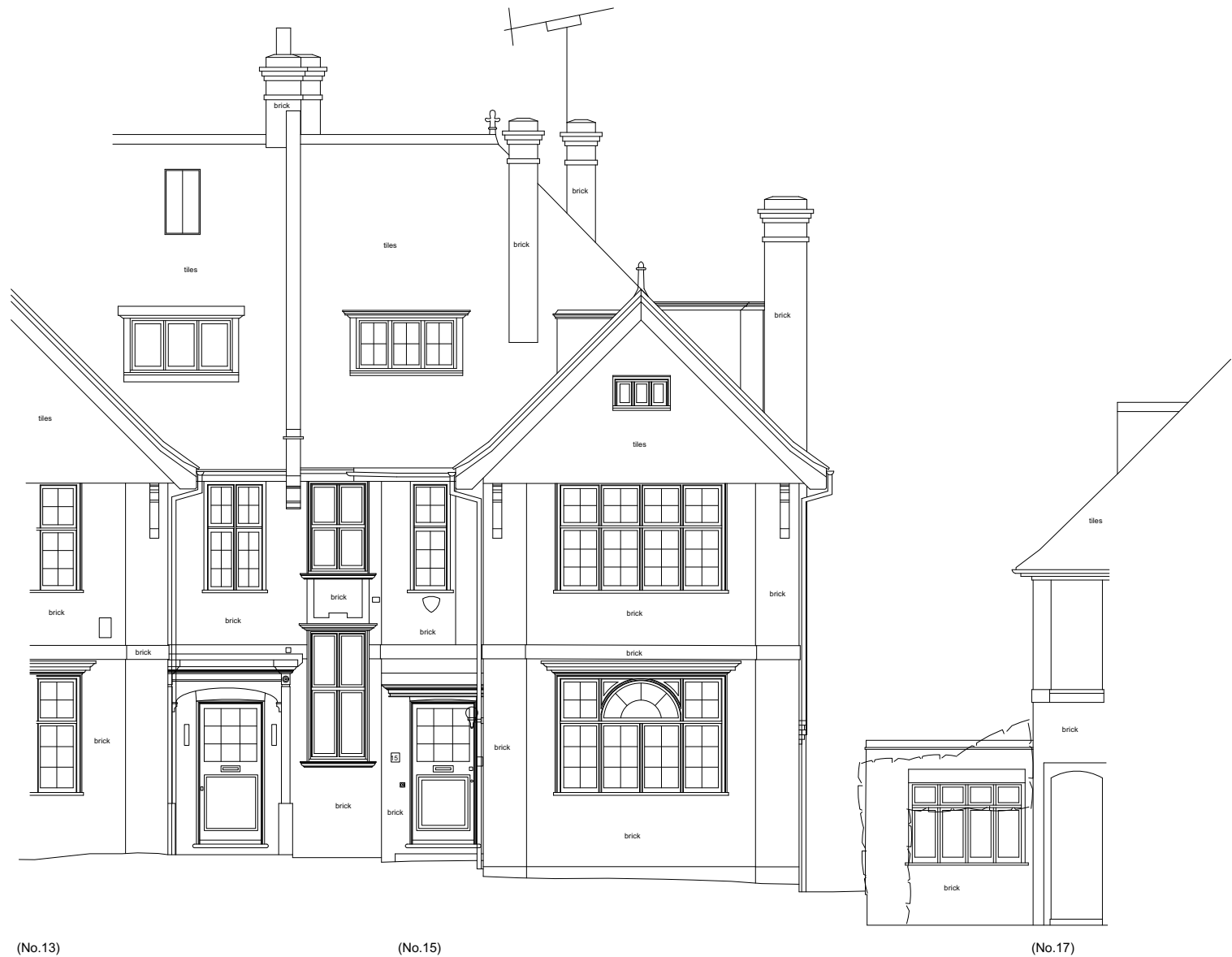
SOUTH-WEST ELEVATION (FRONT) A.O.D. 72.00m