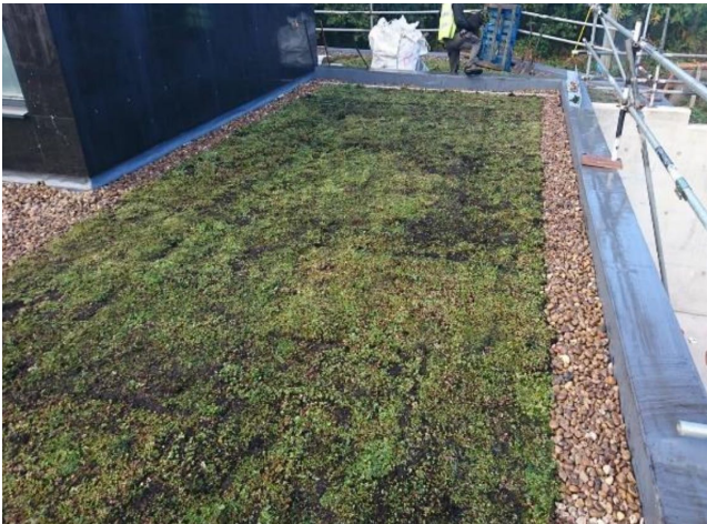
Example image of Skygarden product installation