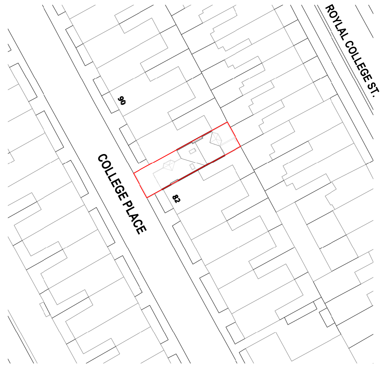
BLOCK PLAN 1 : 500 @A3