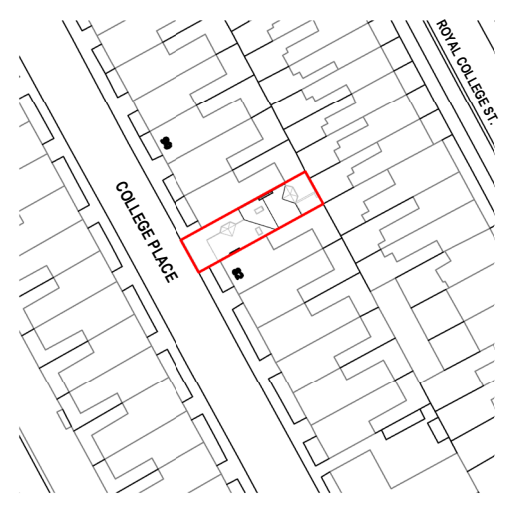
LOCATION PLAN 1 : 1250 @A3

Written dimensions to be taken in preference to scaled dimensions. The Contractor is responsible for checking all dimensions before work starts. All work is to be carried out to the requirements, and to the satisfaction of the Local Authority. These drawings are for planning purposes only. Any discrepancies to be brought to the attention of 4D Planning Consultants immediately.