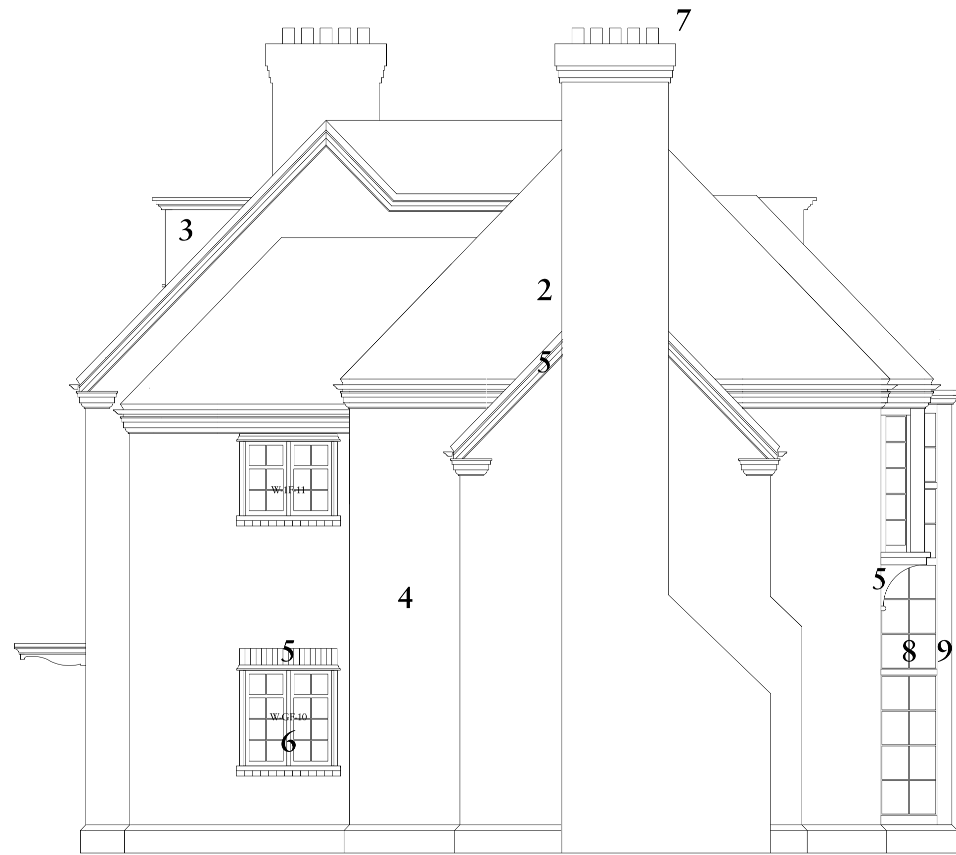
01 West Elevation Scale: 1:50

In the event of any detail or dimensional conflict between Charlton Brown Architects drawings, the matter must be referred back to Charlton Brown Architects for clarification