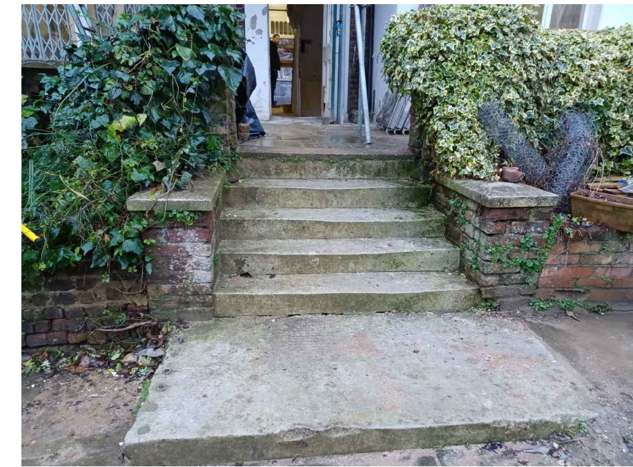
Reference image of existing step and slab