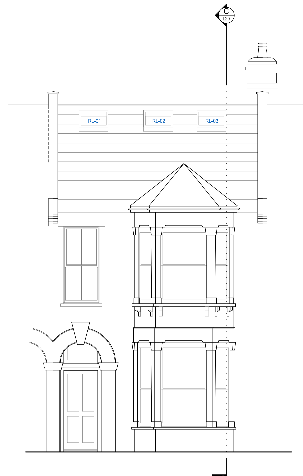
D L20 EXISTING FRONT ELEVATION 1:50