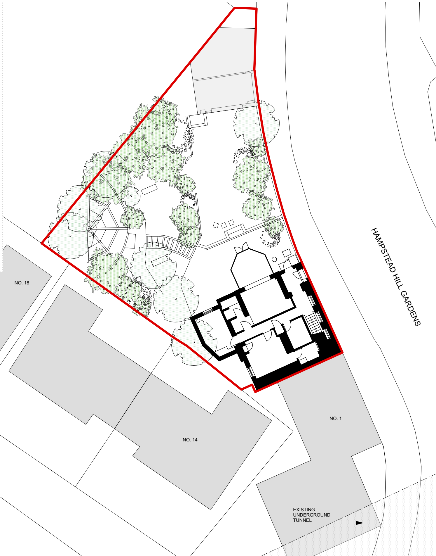
0 2 4 6 8 METRES EXISTING SITE PLAN @ 1:200