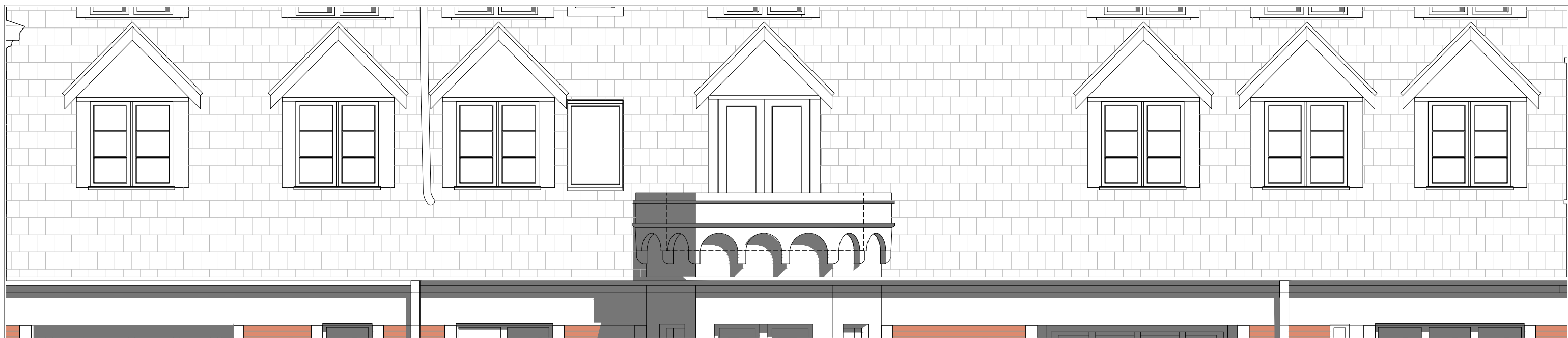
Flat 8 Mansard Elevation - Existing