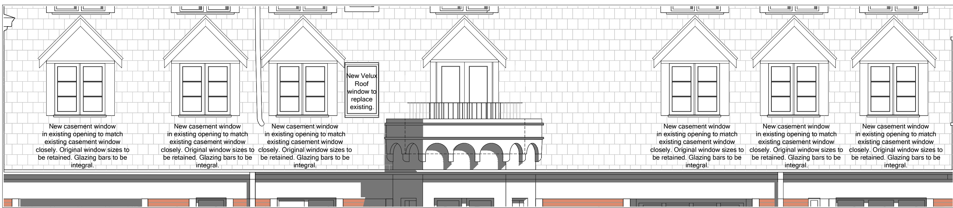
Flat 8 Mansard Elevation - Proposed

New Velux Roof window to replace existing.